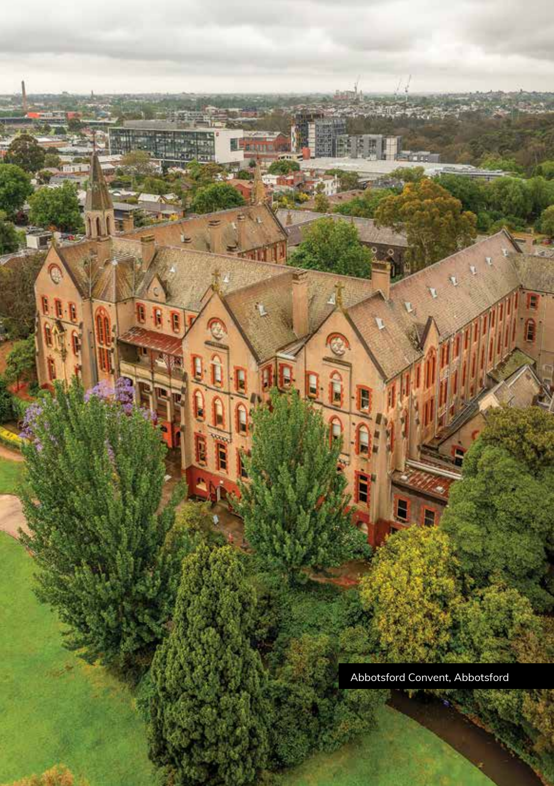
Abbotsford Convent, Abbotsford