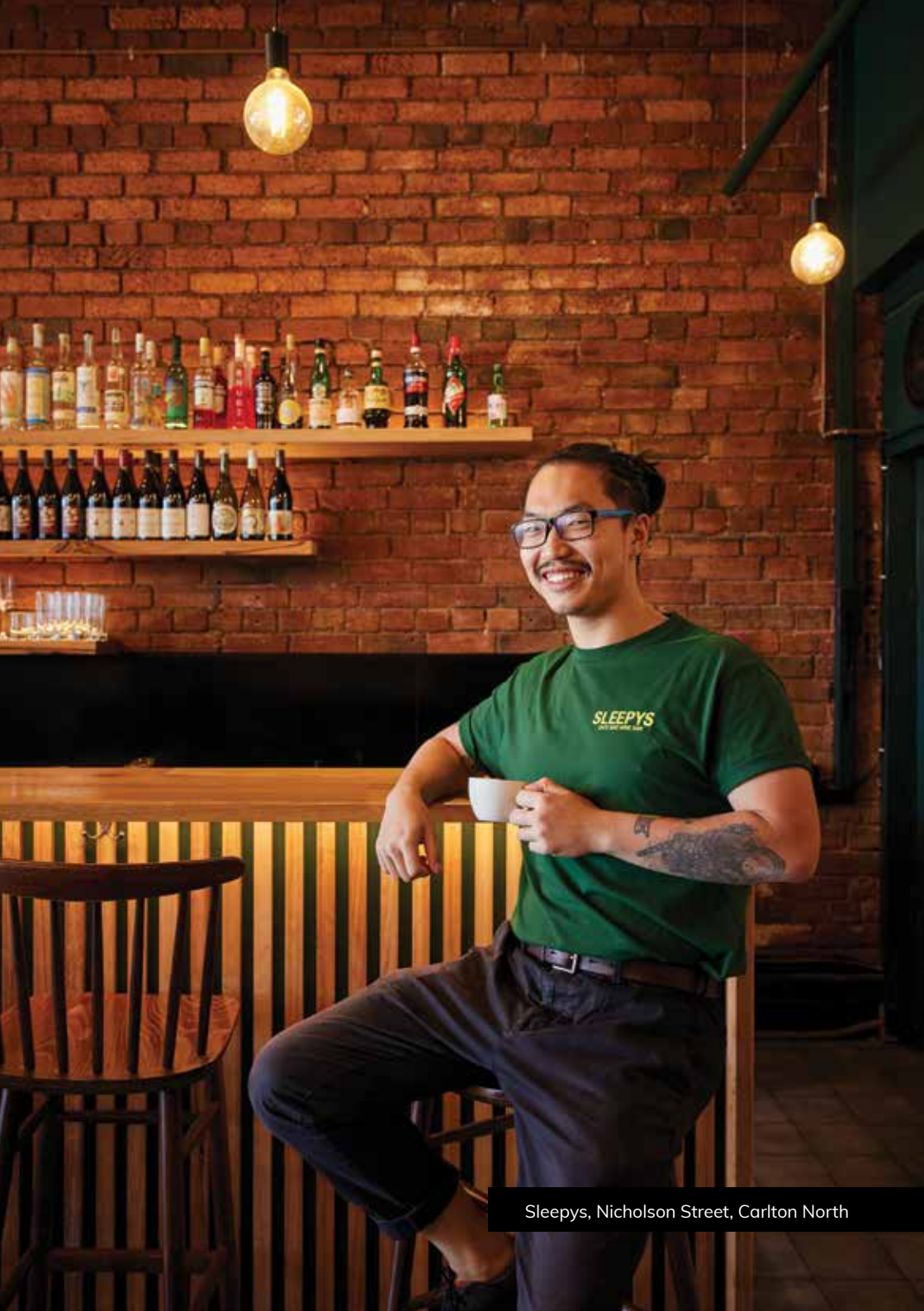
Sleepys, Nicholson Street, Carlton North