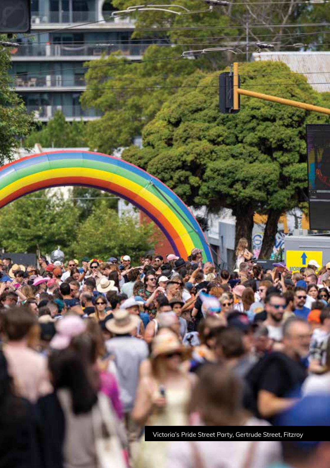
Victoria's Pride Street Party, Gertrude Street, Fitzroy