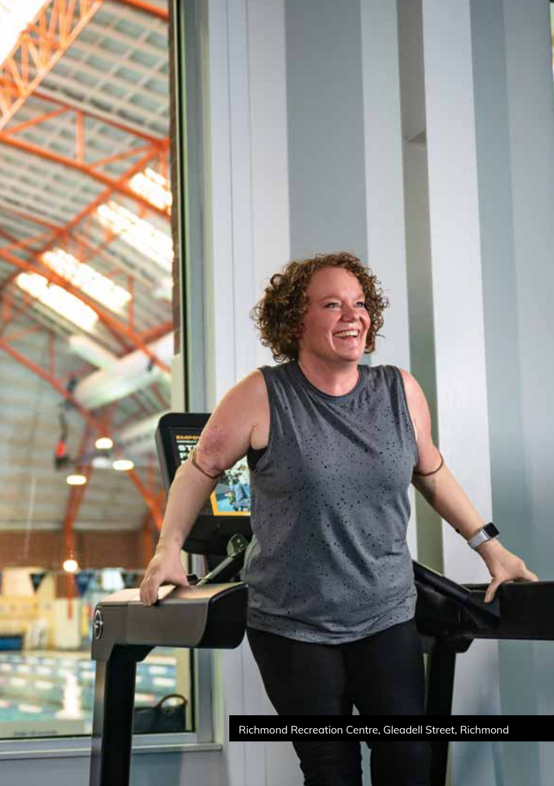
Richmond Recreation Centre, Gleadell Street, Richmond