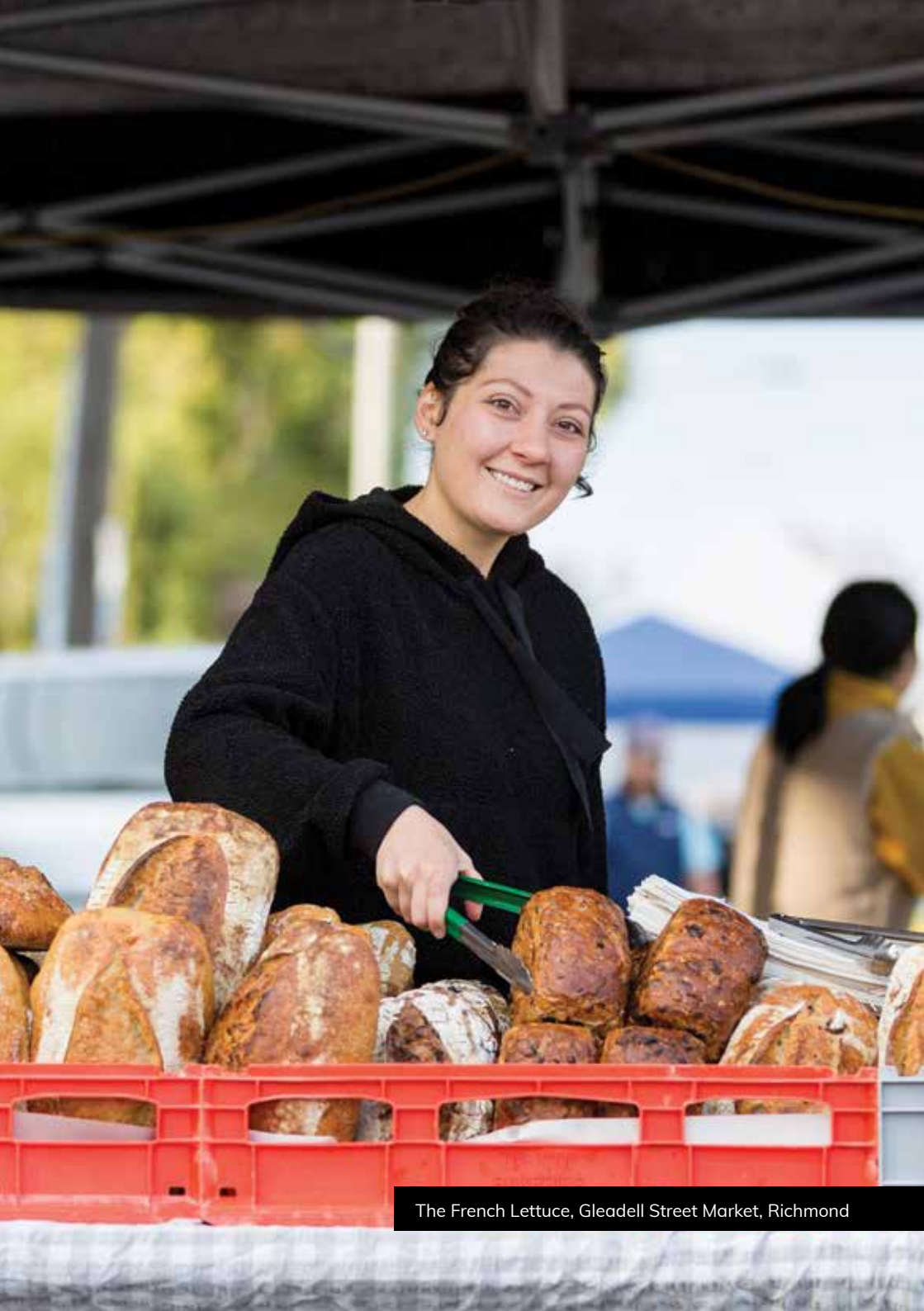
The French Lettuce, Gleadell Street Market, Richmond