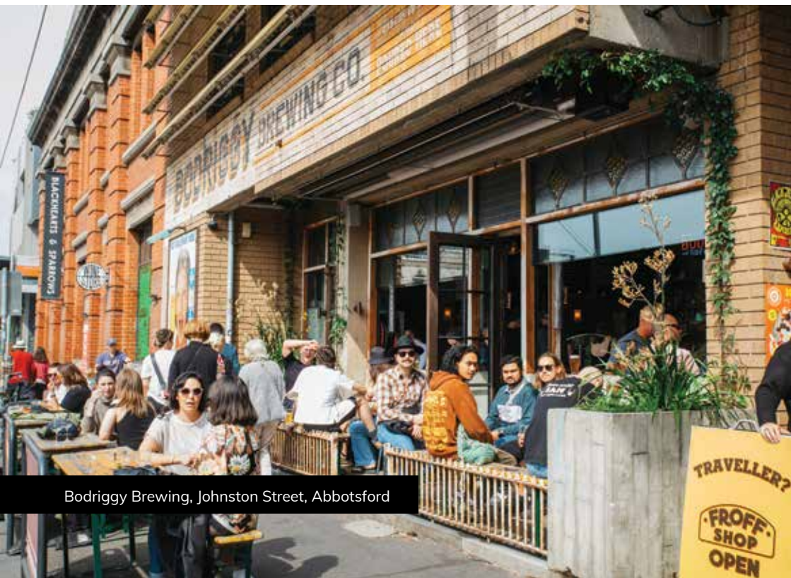
Bodriggy Brewing, Johnston Street, Abbotsford

For more information visit yarracity.vic.gov.au/waste