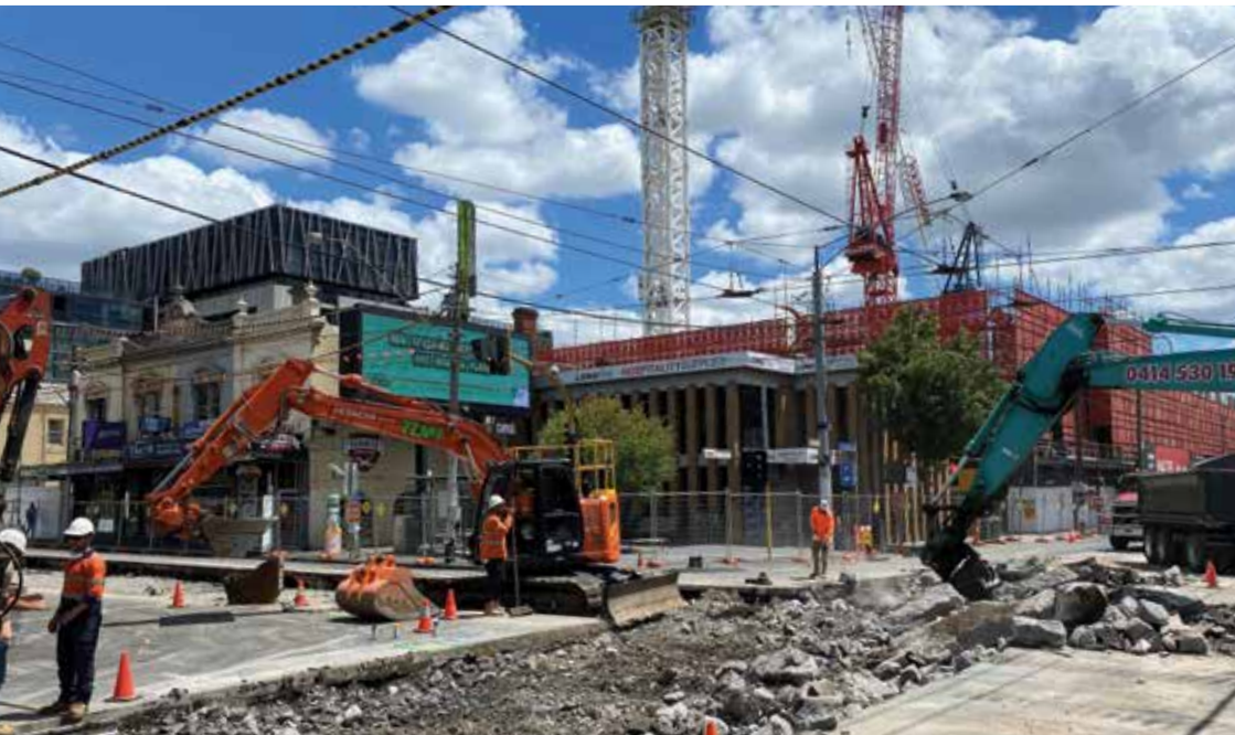
Road and tram works can have serious impacts on small businesses

If you would like to know more about disruptions in your area see our directory of major authorities that carry out works within Yarra yarracity.vic.gov.au/disruptions