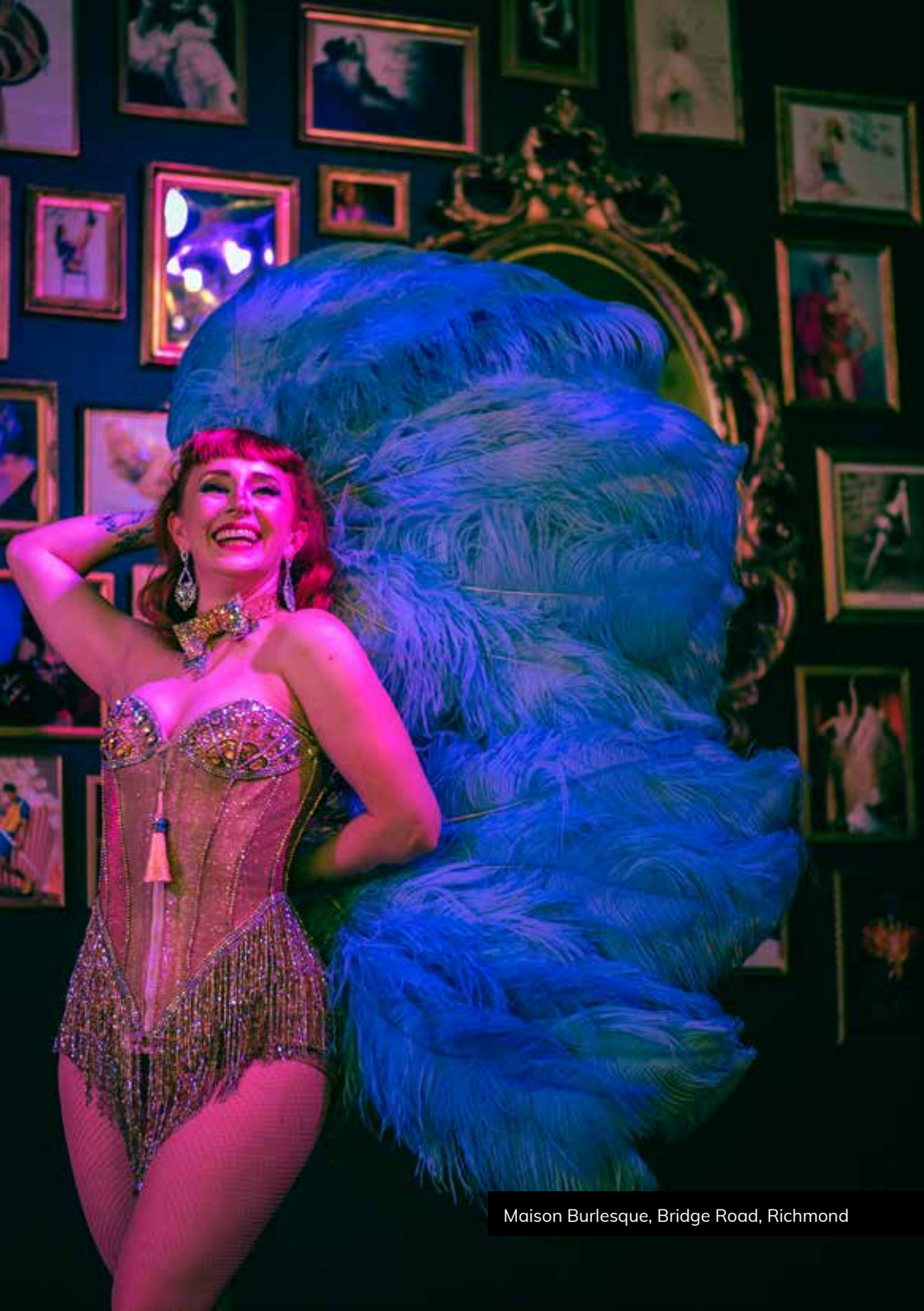
Maison Burlesque, Bridge Road, Richmond