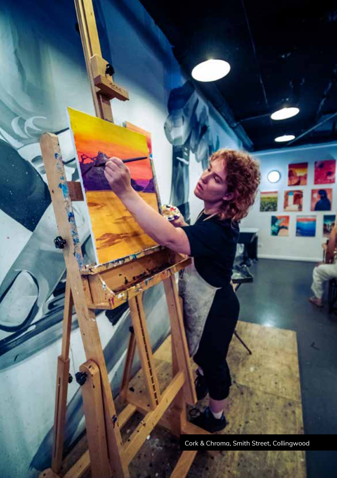
Cork & Chroma, Smith Street, Collingwood