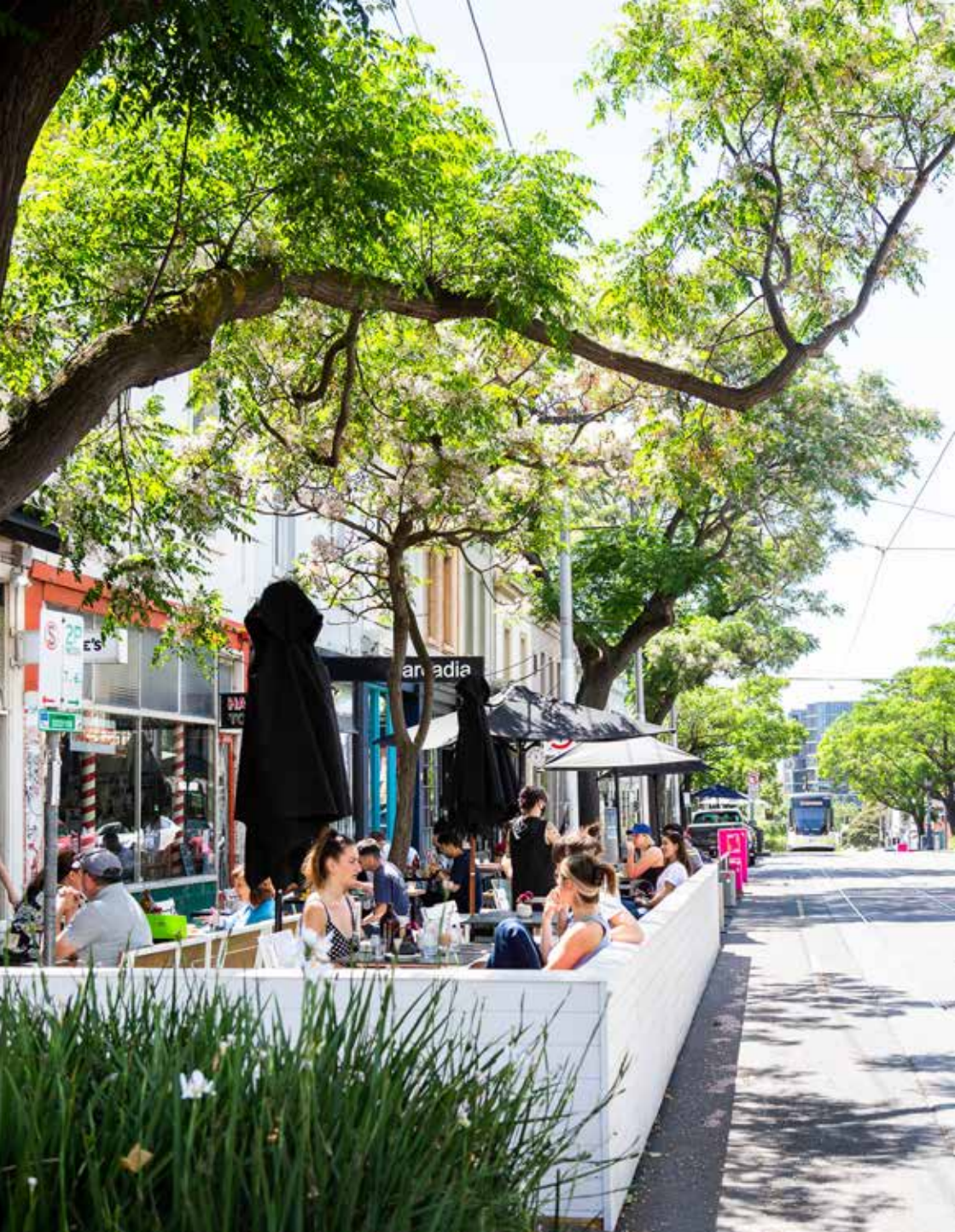
Archie's All Day, Gertrude Street, Fitzroy