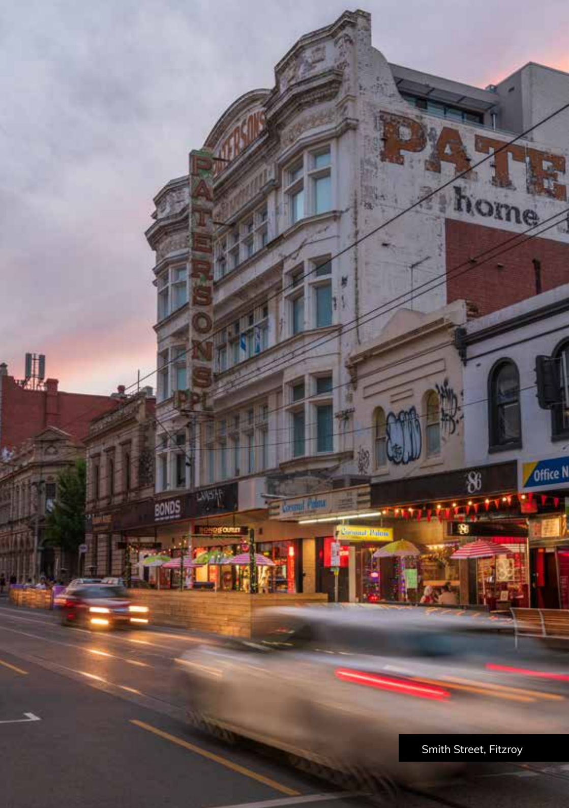
Smith Street, Fitzroy