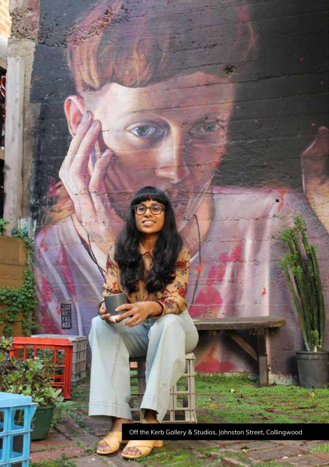
Off the Kerb Gallery & Studios, Johnston Street, Collingwood