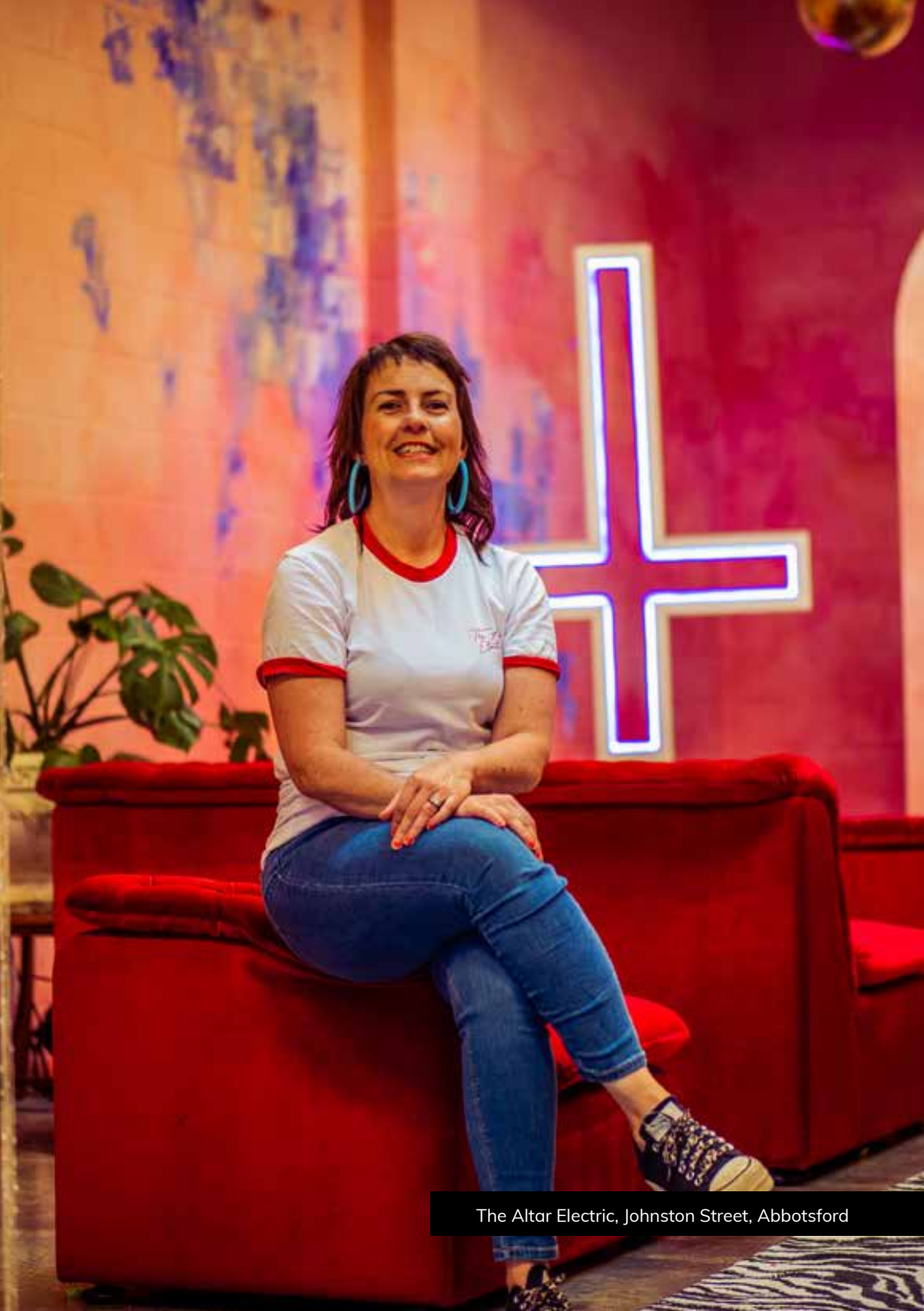
The Altar Electric, Johnston Street, Abbotsford