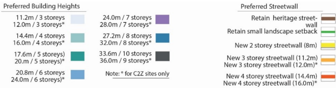
Map 2: Street Wall and Building Heights (east of Wellington Street)