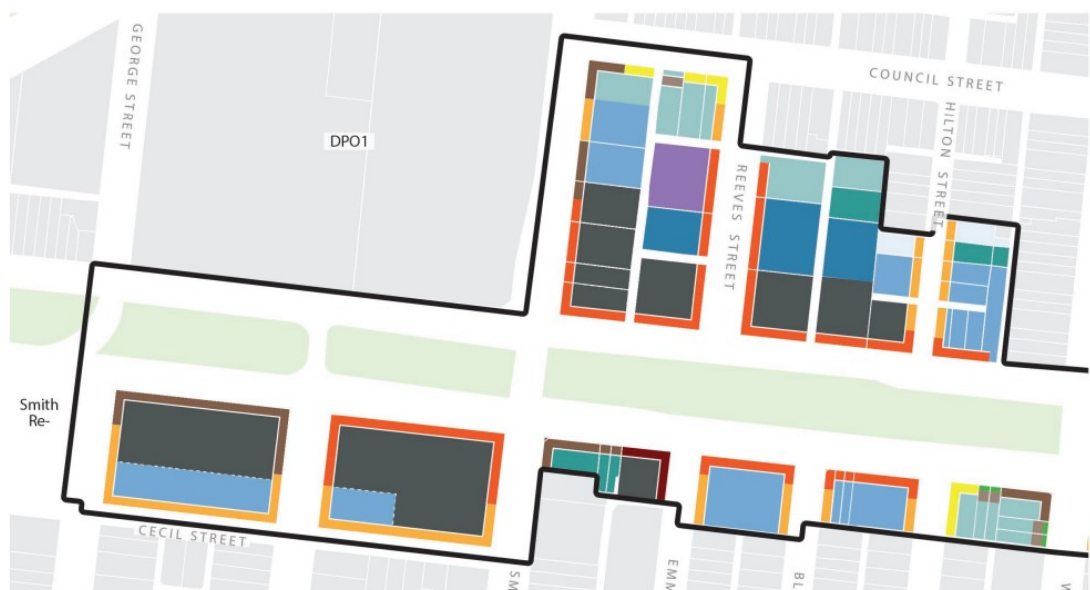
Map 1: Street Wall and Building Heights (west of Wellington Street)