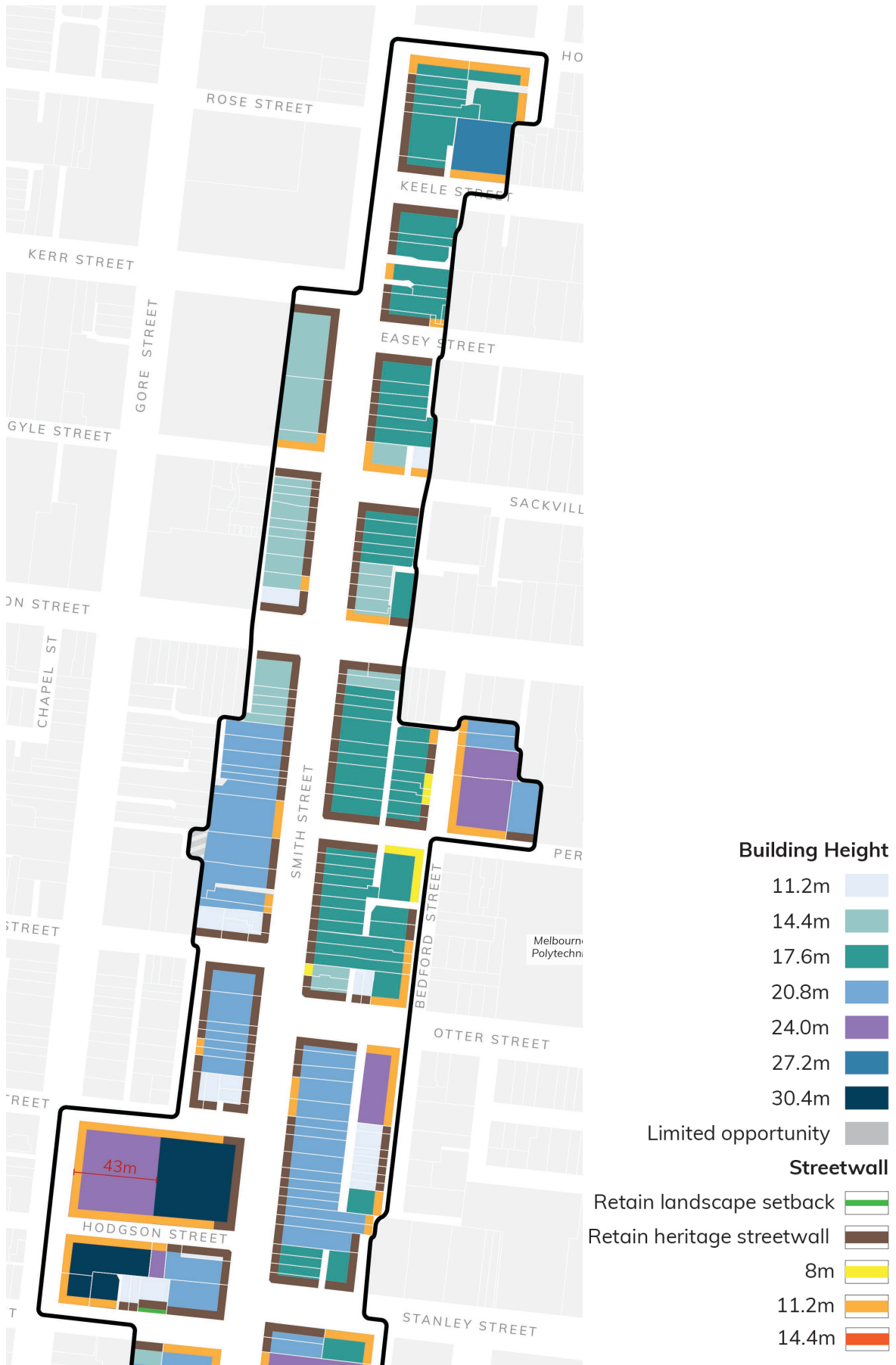
Map 1: Street Wall and Building Heights North of Stanley and Moor Streets