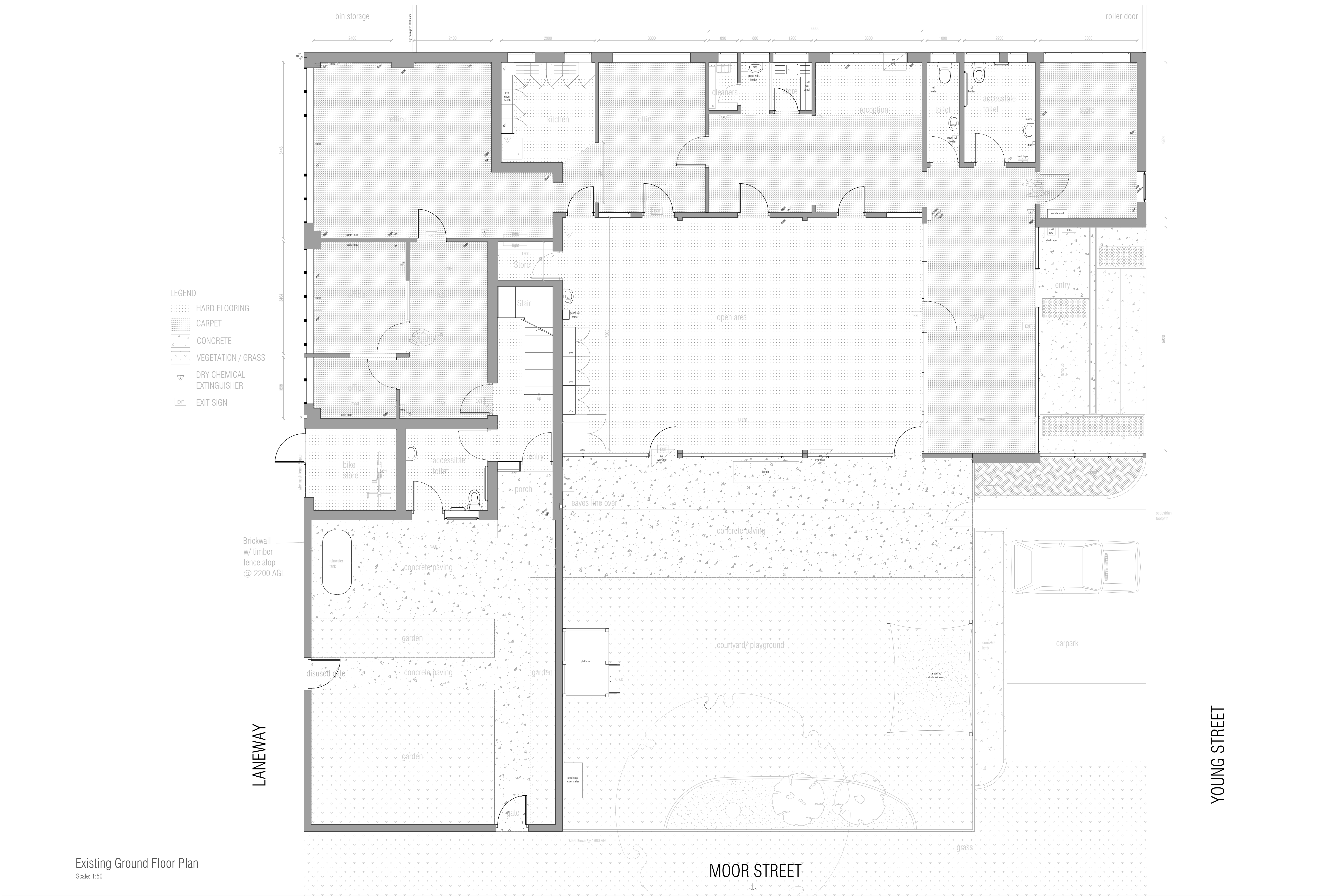
Existing Ground Floor Plan Scale: 1:50