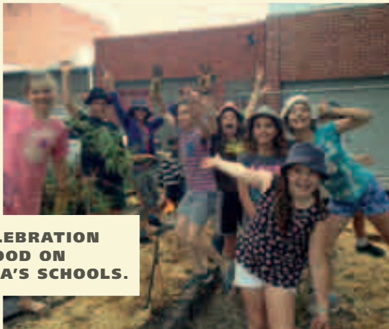
A CELEBRATION OF FOOD ON YARRA’S SCHOOLS.

Established in 1979, developed as an opportunity for city children to experience a farm and country existence.