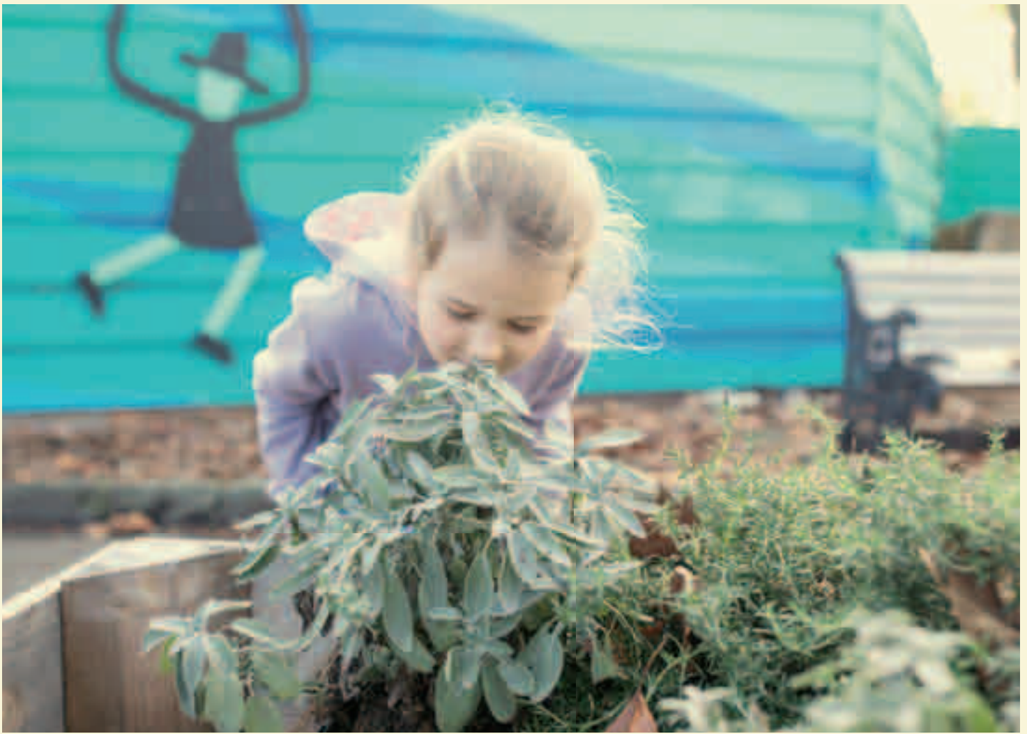
COMMUNITY PLANTING DAY IN RICHMOND 2014.