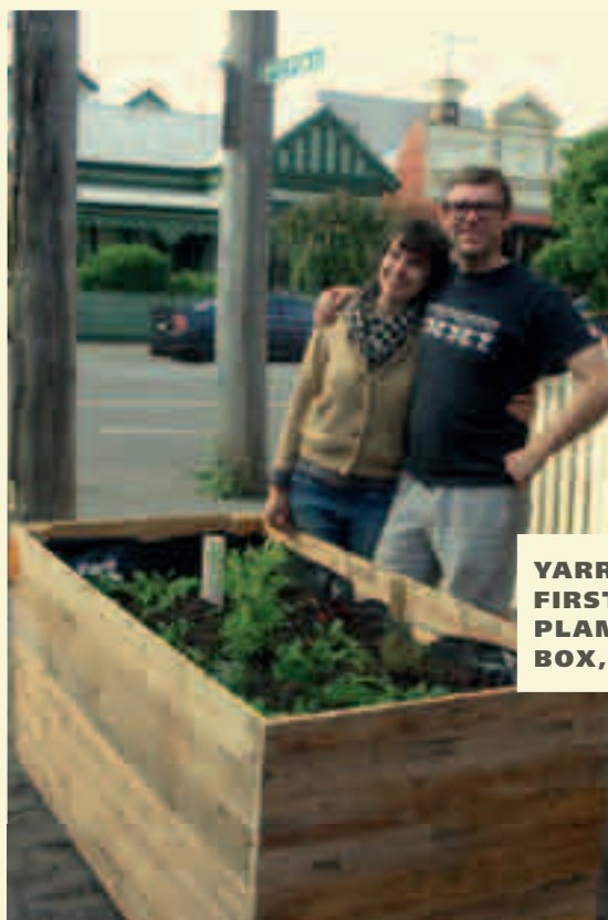
YARRA'S FIRST PLANTER BOX, 2012.