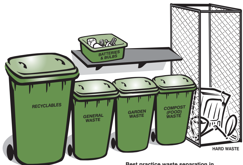
Best practice waste separation in multi-unit residential developments.

Construction sites can represent a great burden on local waterways. Site litter, paint, solvents, bricks, cleaning substances and clean-fill can all contaminate stormwater runoff. It is an offence under the Environment Protection Act to discharge contaminated water into the stormwater system. To avoid contamination, ensure that a drainage system is installed before construction activities commence and storm water is diverted from areas where soil is exposed.