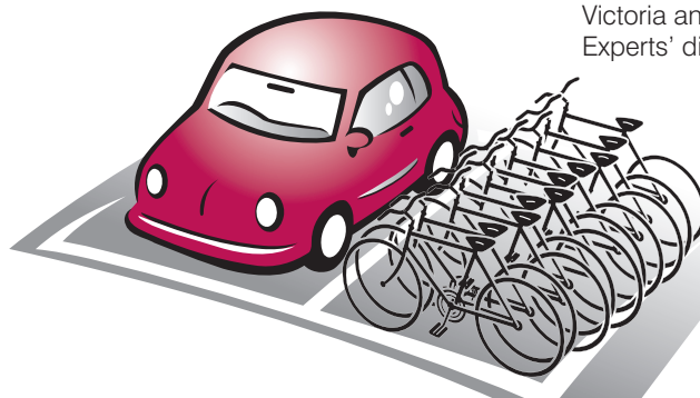
One car space can usually be converted to 10 to 14 bike parking spaces.

In recent years, the bicycle industry has developed a wide range of parking solutions addressing product selection criteria, such as space availability, user preferences and security requirements. The table below provides an overview of the most common bicycle parking systems. For further details, we recommend referring to the 'Bicycle Parking Handbook' from Bicycle Network Victoria and talking to their 'Bike Parking Experts' division