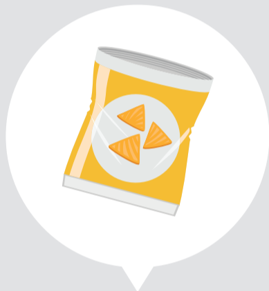
Chip and cracker packets (silver lined)