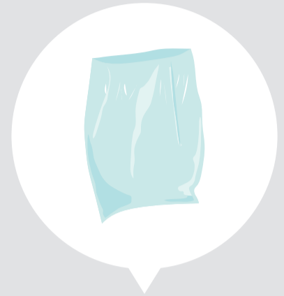
Clean bread bags (without the tag)