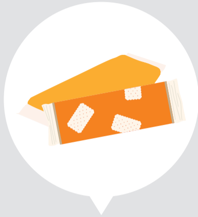
Biscuit packets (outer wrapper only)