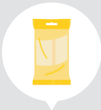
Other plastic wrapping (e.g. from stationery items)