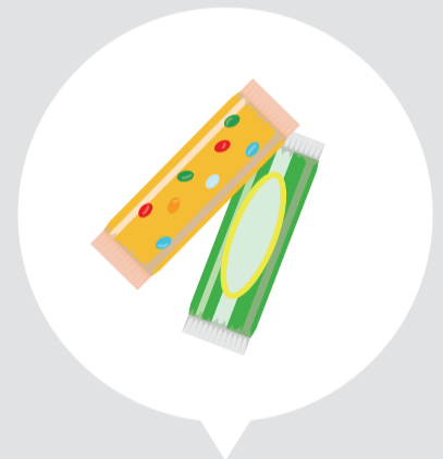
Chocolate and snack bar wrappers