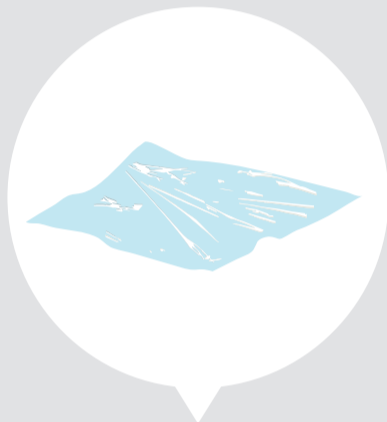
Clean cling wrap