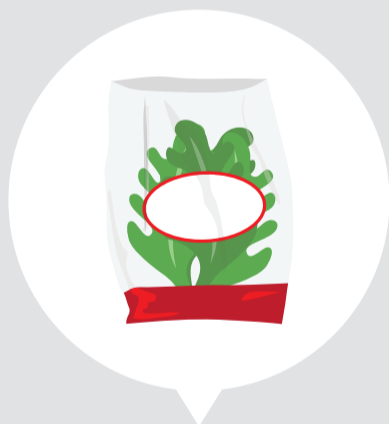
Fresh produce packaging