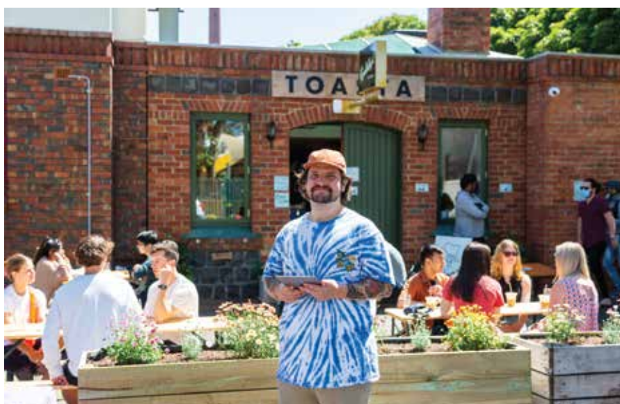
Collingwood is just one of Yarra's vibrant precincts

These initiatives will help attract more visitors to these precincts, encouraging people to shop, eat, and have fun in their local area again after months of restrictions.