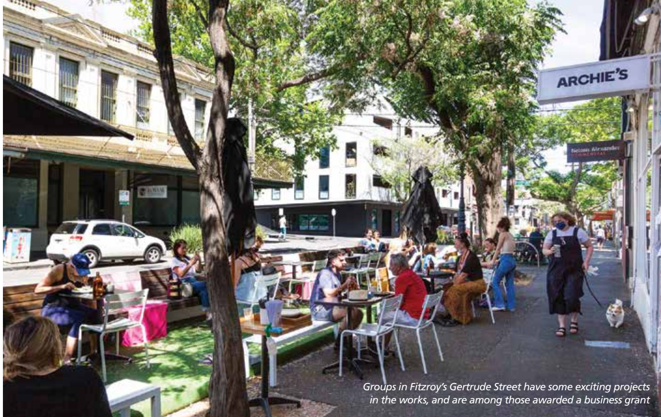
Groups in Fitzroy's Gertrude Street have some exciting projects in the works, and are among those awarded a business grant