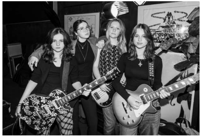
The Nancys, part of Fitzroy Block Party

The Fitzroy Block Party is a celebration of all things local, held at Condell Reserve in the heart of the Fitzroy Arts precinct featuring live music from under-18s bands on the famous 'Bandwagon ute' stage, food and market stalls co-ordinated by Fitzroy Learning Network. YoWo Music runs a contemporary music program for young women and gender diverse teens in high school.