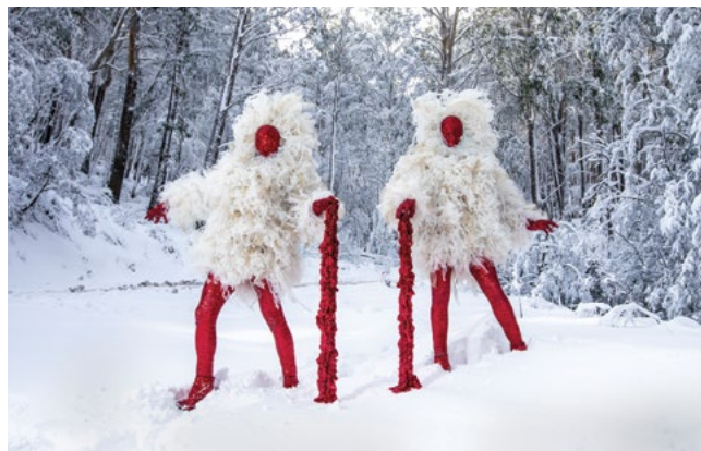
Melting Moments, The Huxleys 2021

Go for a wander by the Yarra to experience something strange and fabulous from performance duo The Huxleys. This event will be a roaming, waterborne performance along the river in the Yarra Bend area. Be sure to bring a picnic and enjoy the show! There are locations up and down the Yarra between Dights Falls and Chandler Highway, with a great vantage point from the Fairfield Boathouse.