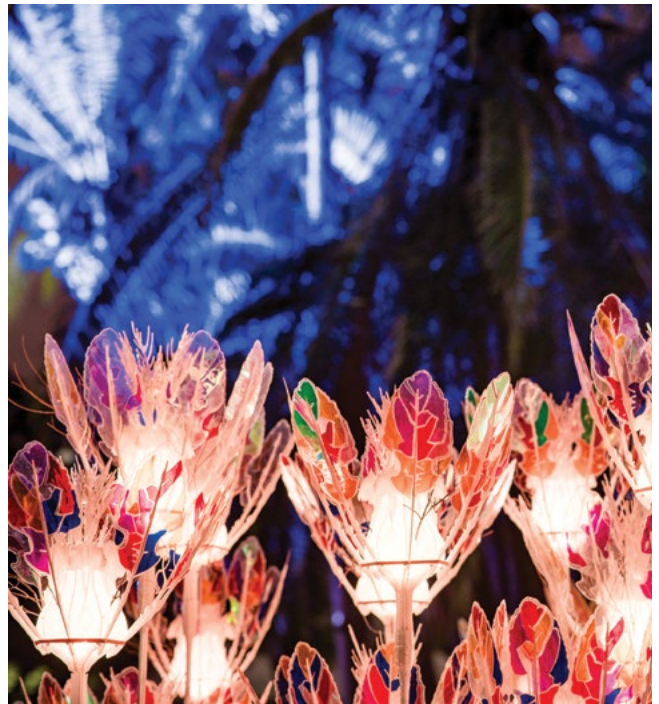
Bastions of Light by Skunk Control, photo by Dave Kan.

Please note that alcohol is not allowed in our public places over New Year's Eve, from 9pm on 30 December to 9am 1 January.