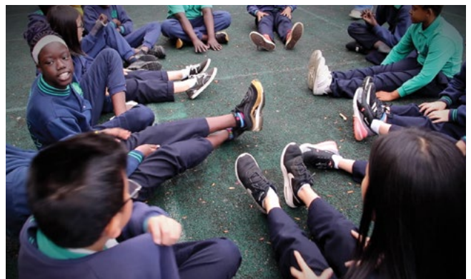
Sacred Heart students in scenes of their music video 'Double Double Culture'.

Watch the award-winning music video and learn more about the project online at storyscape.com.au