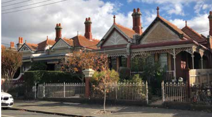
The parking bay in Mcllwraith Street, Princes Hill, will be paved with recycled tyres