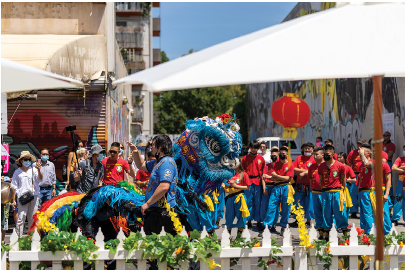
Victoria Street Lunar Festival

Details about these and more events around Yarra are available at yarracity.vic.gov.au/events