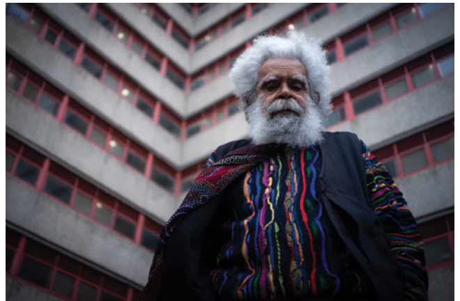
Uncle Jack Charles