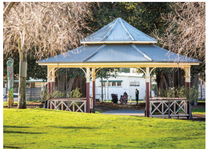
Curtain Square in Carlton North

Find the latest Yarra news at yarracity.vic.gov.au/news