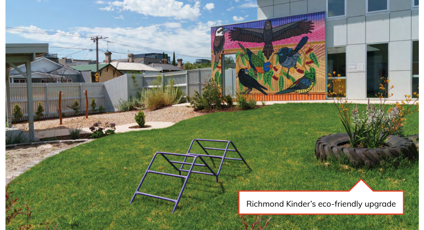
Richmond Kinder's eco-friendly upgrade

Visit yoursayyarra.com.au before the consultation closes on Monday 6 May. Together, we can make sure that people and nature in Yarra thrive for generations to come.