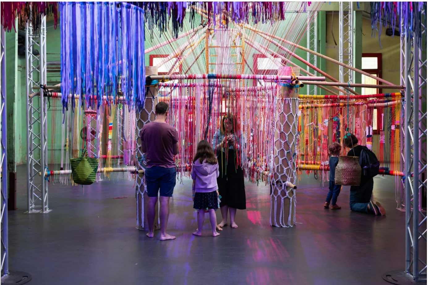
Slow Art Collective Pavilion, 2023 Annual Grant Recipients