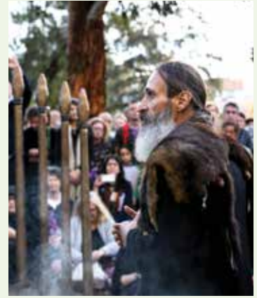
On National Sorry Day, Sunday 26 May, we acknowledge and pay tribute to the Stolen Generations.

Reserve your place now at yarracity.vic.gov.au/blakwiz2019