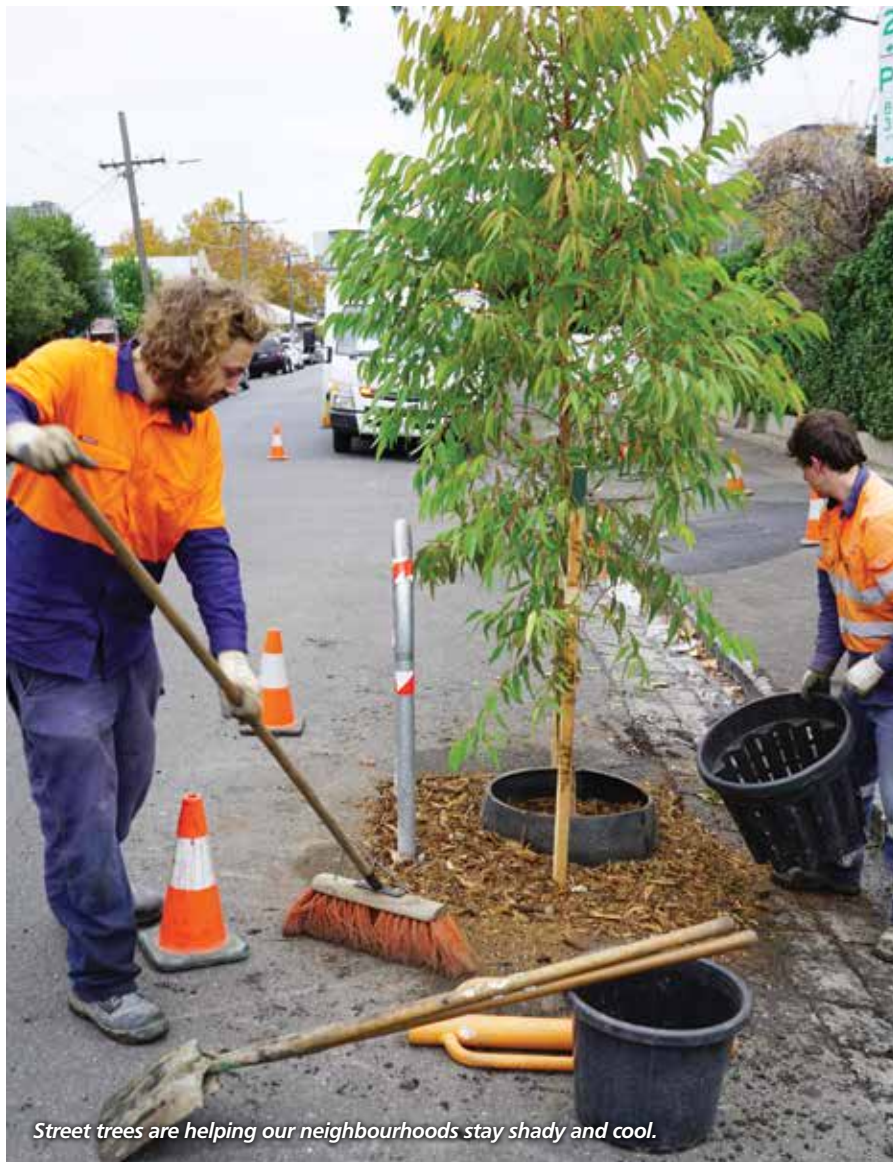
Street trees are helping our neighbourhoods stay shady and cool.