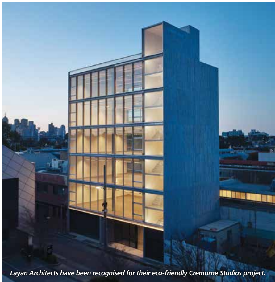
Layan Architects have been recognised for their eco-friendly Cremorne Studios project.

Visit yarracity.vic.gov.au/sustainabilityawards to learn more about this year's award winners.