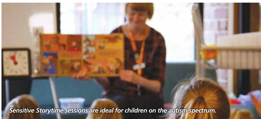
Sensitive Storytime sessions are ideal for children on the autism spectrum.

We are incorporating sensory aids to help children and carers benefit from regular storytime sessions in a more sensory controlled environment and without the crowds. Tools include a visual timer, schedule board with Picture Exchange Communication System (PECS) cards and a sensory tent.