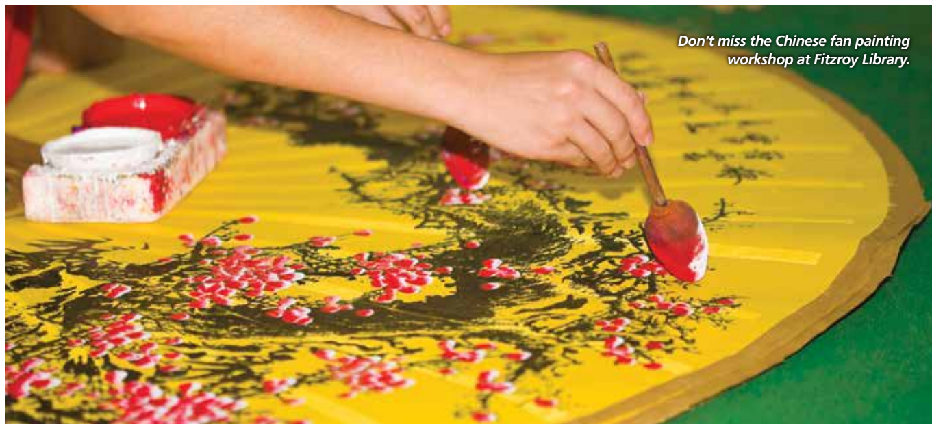
Don't miss the Chinese fan painting workshop at Fitzroy Library.