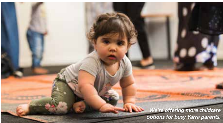
We're offering more childcare options for busy Yarra parents.

Our other valued partners included Transdev, the Youth Support and Advocacy Service and the Nicholson Village traders.