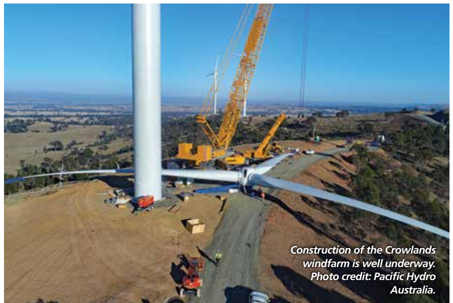
Construction of the Crowlands windfarm is well underway.

Visit yarracity.vic.gov.au/climate2019 to learn more about our response to the climate emergency.