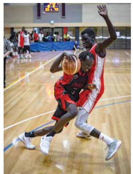
A shared passion for basketball is bringing local young people together.

Visit yarracity.vic.gov.au/getactive to learn more about sports, fitness and lifestyle opportunities in Yarra.