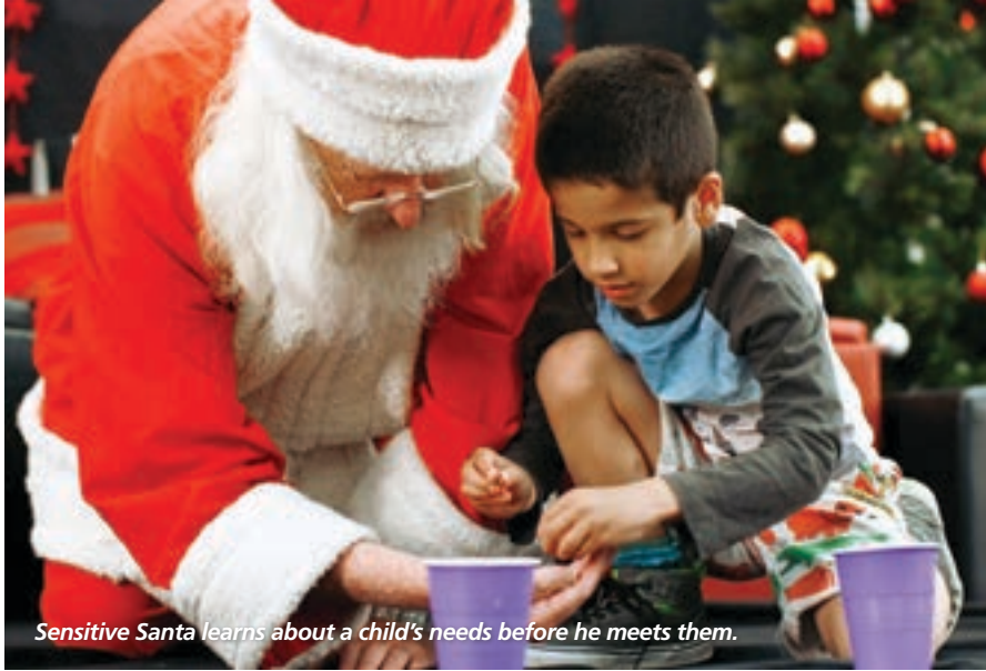
Sensitive Santa learns about a child's needs before he meets them.