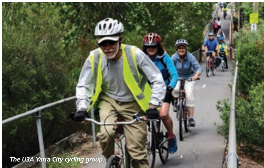
The U3A Yarra City cycling group.

Most of the Melbourne rides start and finish near train stations, and avoid major roads and traffic. Their detailed descriptions also include coffee shop