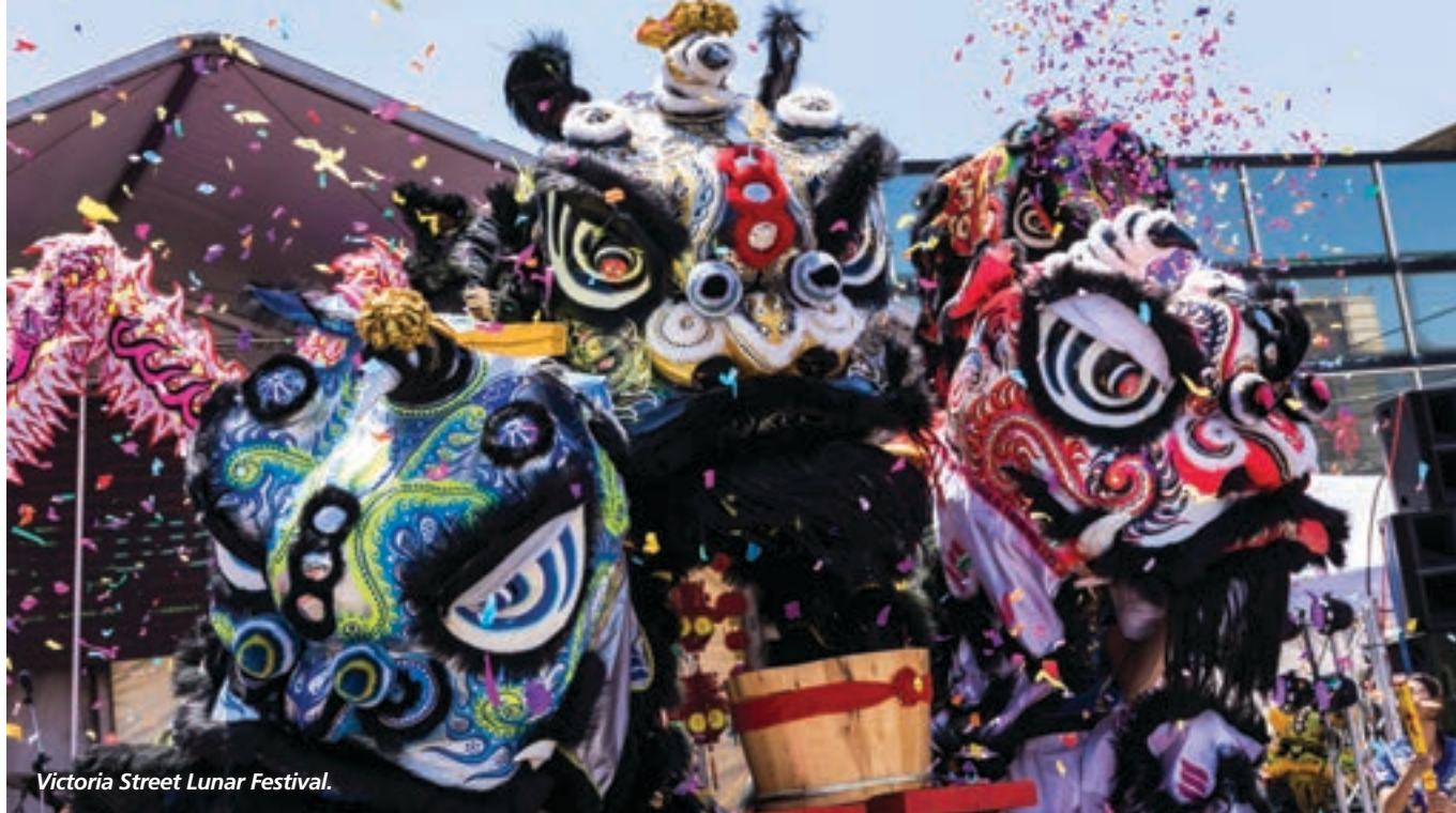
Victoria Street Lunar Festival.