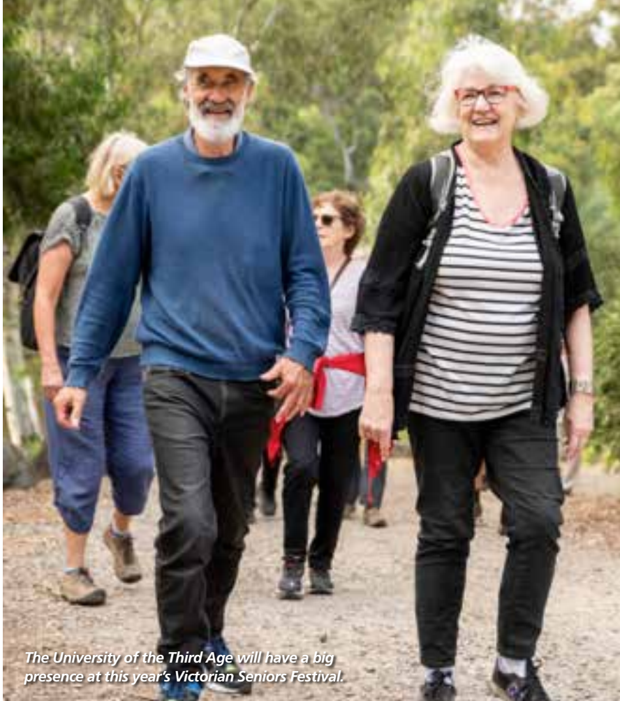
The University of the Third Age will have a big presence at this year's Victorian Seniors Festival.