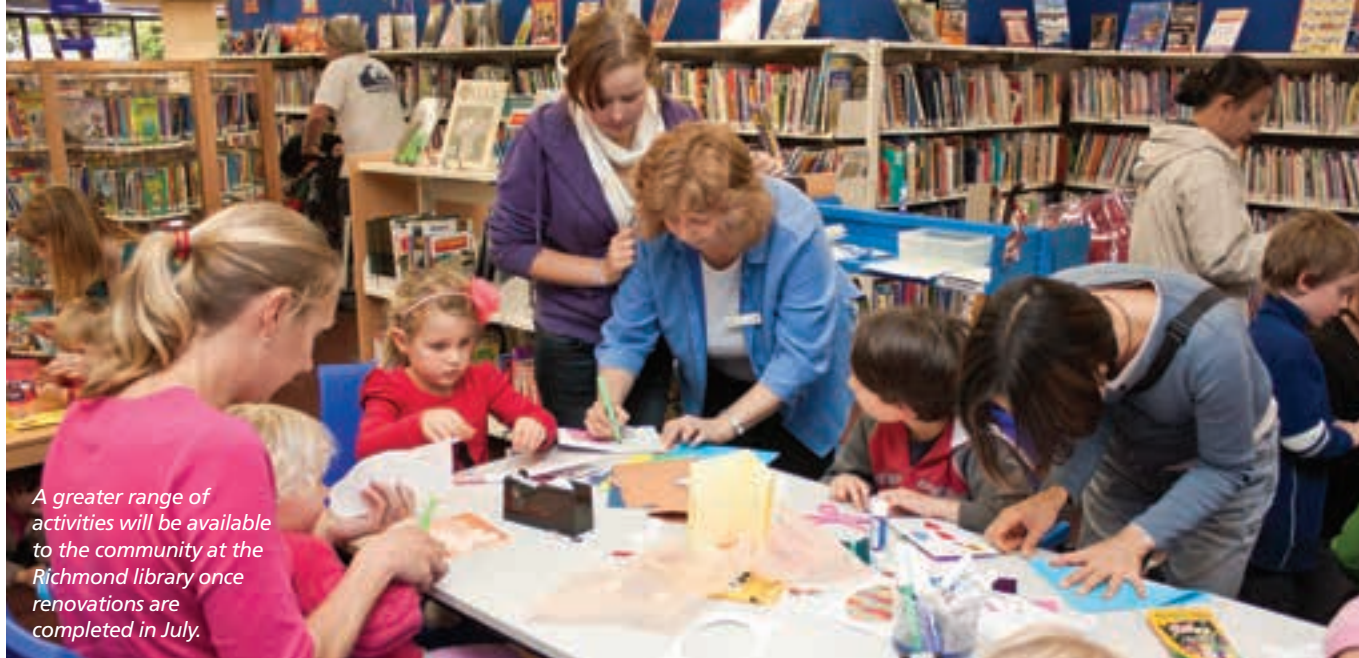
A greater range of activities will be available to the community at the Richmond library once renovations are completed in July.