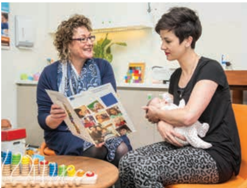
Your rates help fund a wide variety of Council services, including community and family-focused programs.

For more information and to have your say on these and other issues Council is currently seeking feedback on, visit www.yarracity.vic.gov.au/Consultation