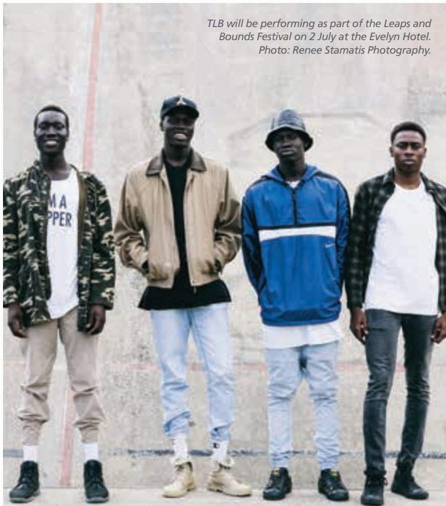
TLB will be performing as part of the Leaps and Bounds Festival on 2 July at the Evelyn Hotel.

Raised in South Sudan and inspired by the likes of Tupac and Bob Marley, TLB pride themselves on their story-telling. Their songs are about positive social