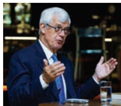
Julian Burnside AO QC will be headlining Yarra's Refugee Week Q&A panel.

Yarra's Refugee Week event will be on Thursday 23 June from 6-8pm at Richmond Town Hall.