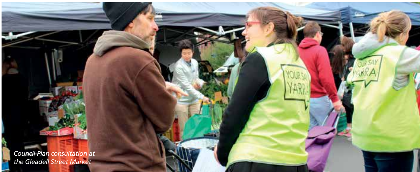
Council Plan consultation at the Gleadell Street Market

In recent months community members have helped us develop our next four year Council Plan by sharing their ideas and telling us about their priorities for the city.