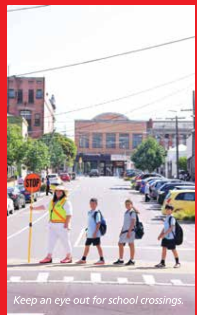
Keep an eye out for school crossings.