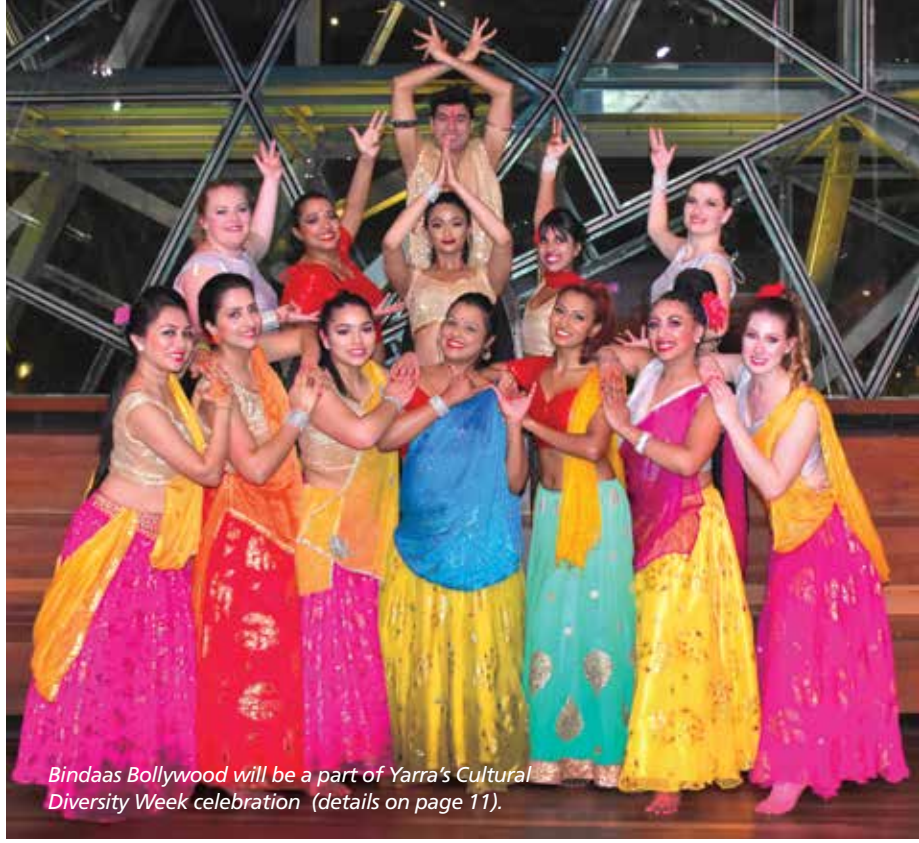
Bindaas Bollywood will be a part of Yarra's Cultural Diversity Week celebration (details on page 11).

سيتم بث اعلانات من اصداره Yarra News هذه عبر برنامج صوت إريتيريا الإذاعي في أيام الاثنين من الساعة 7 صباحاً، على التردد .3CR 855 AM