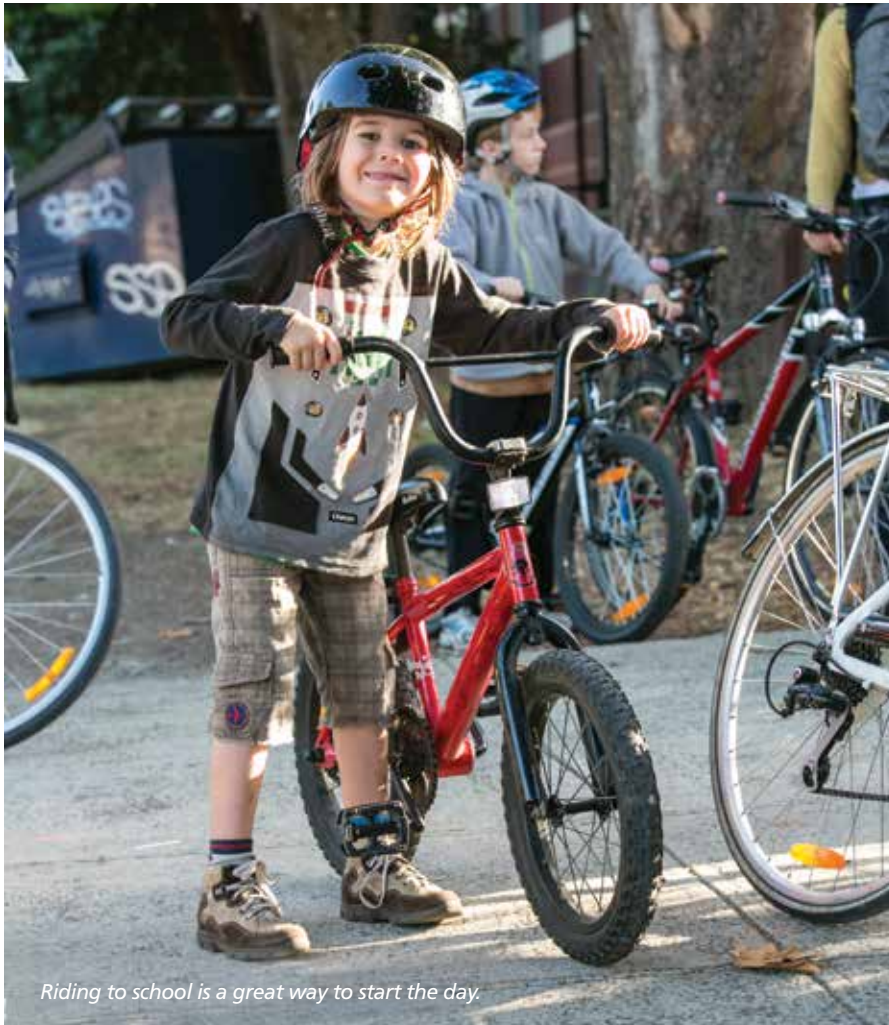
Riding to school is a great way to start the day.

With our local kindergartens and schools now back from the summer break, kids of all ages are walking or riding to school, often with a parent or guardian in tow.