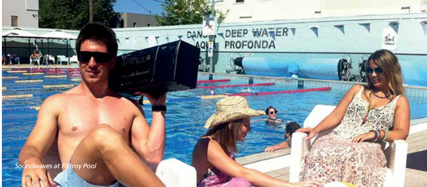
Soundwaves at Fitzroy Pool