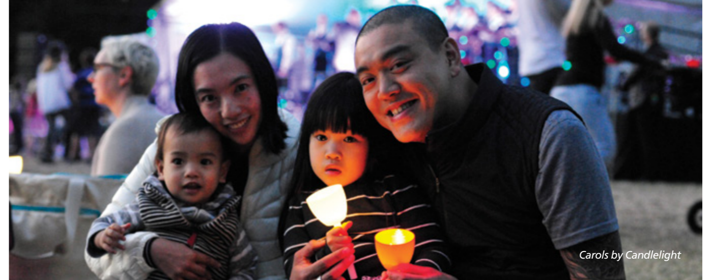
Carols by Candlelight