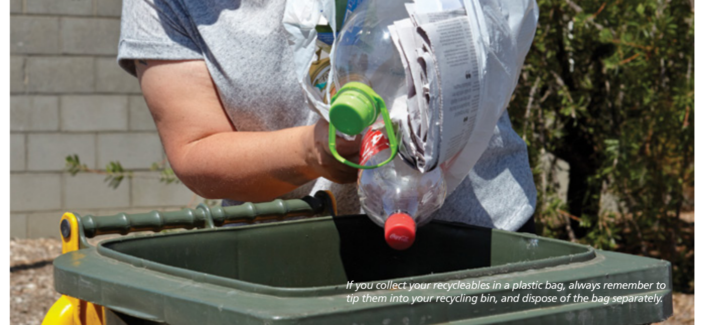
If you collect your recycleables in a plastic bag, always remember to tip them into your recycling bin, and dispose of the bag separately.