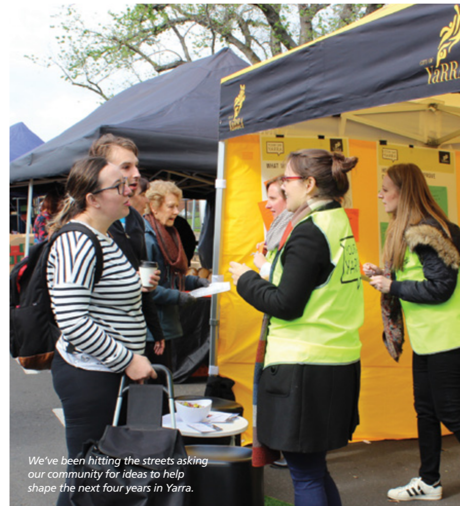
We've been hitting the streets asking our community for ideas to help shape the next four years in Yarra.