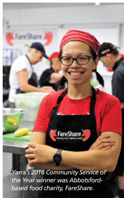
Yarra's 2016 Community Service of the Year winner was Abbotsford-based food charity, FareShare.

Nominations must be received by Friday 16 December.