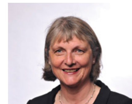
Cr Amanda Stone, Mayor