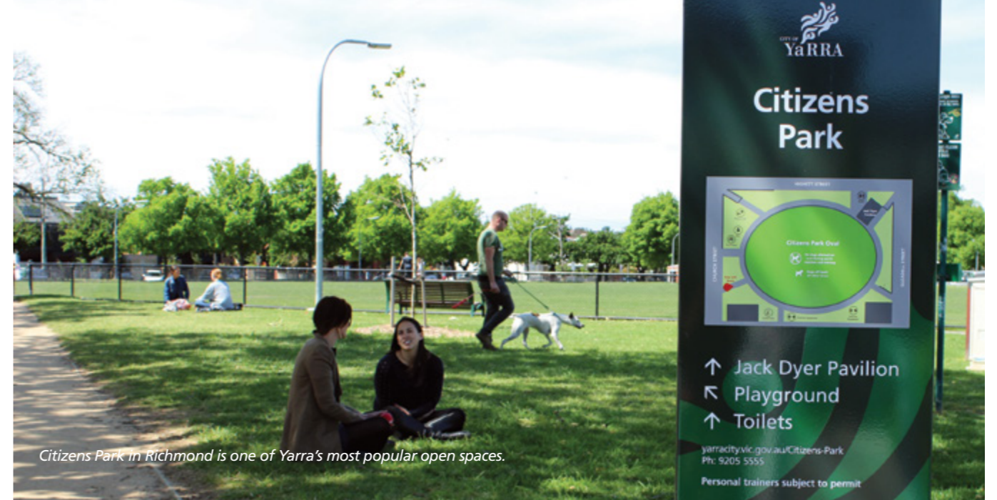
Citizens Park in Richmond is one of Yarra's most popular open spaces.

Learn more about the Aboriginal history of Yarra, take a self-guided walking tour of local sites of significance, and access educational resources at www.aboriginalhistoryofyarra.com.au