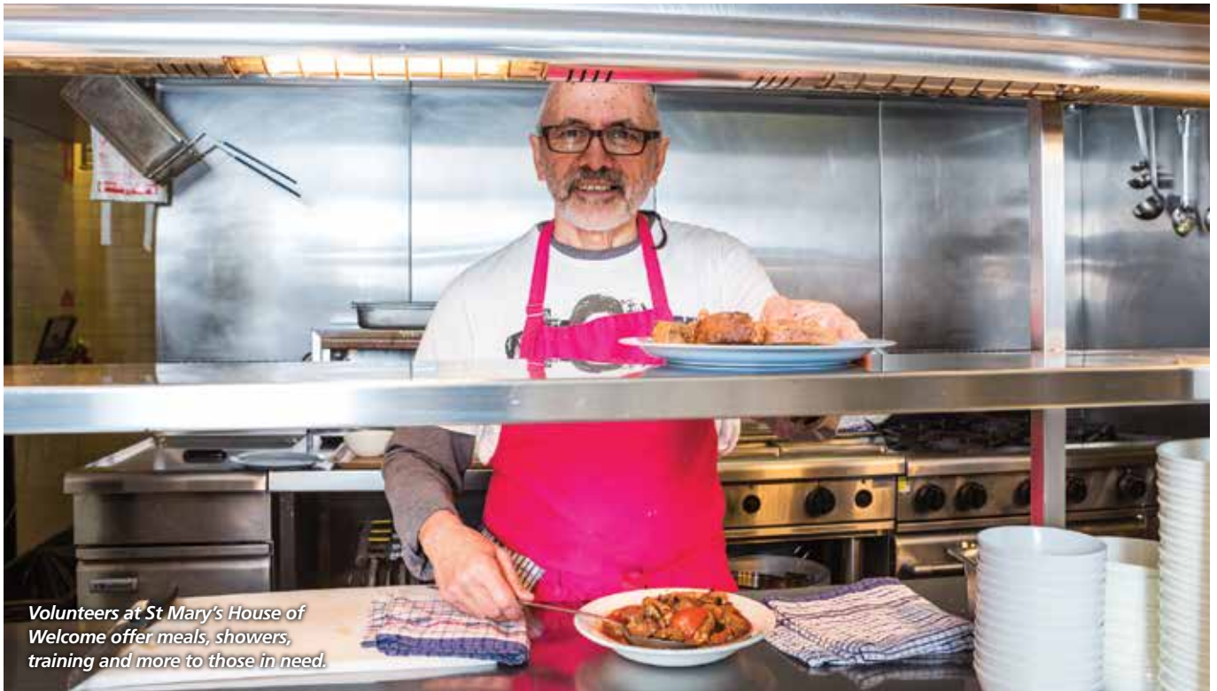
Volunteers at St Mary's House of Welcome offer meals, showers, training and more to those in need.