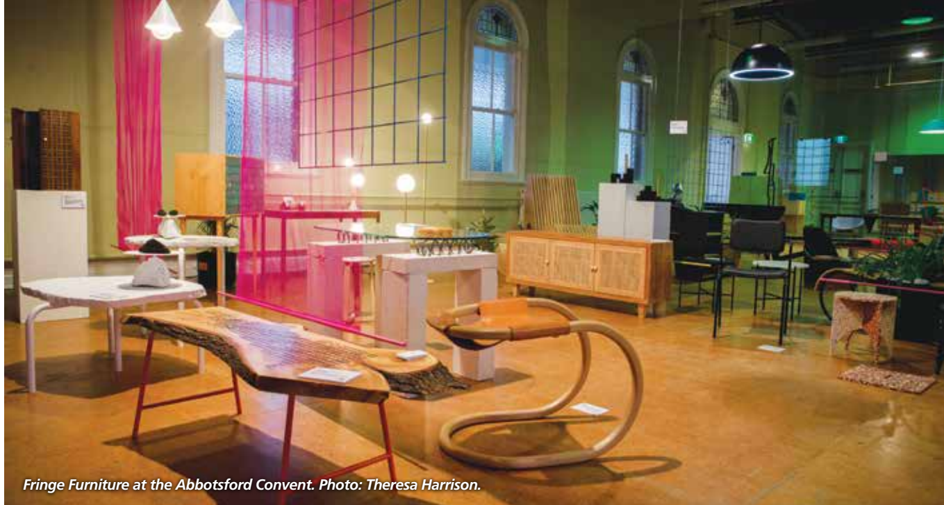
Fringe Furniture at the Abbotsford Convent.