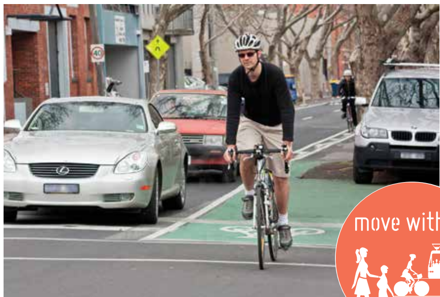
Thanks to Council's investment in road safety, many members of the community choose active travel options such as cycling.

By improving safety on our roads, it's also hoped that even more people will take up active travel options