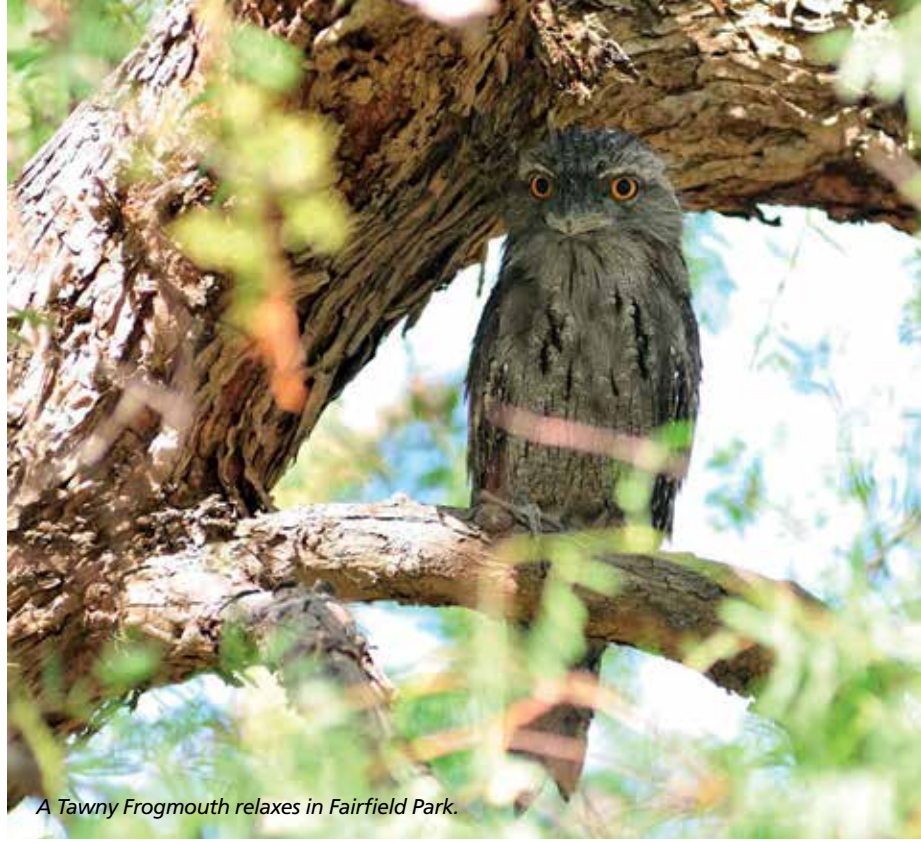
A Tawny Frogmouth relaxes in Fairfield Park.

سيتم بث اعلانات من اصداره هذه عبر برنامج صوت إريتيريا الإذاعي في أيام الاثنين من الساعة 7 صباحاً، على التردد .3CR 855 AM