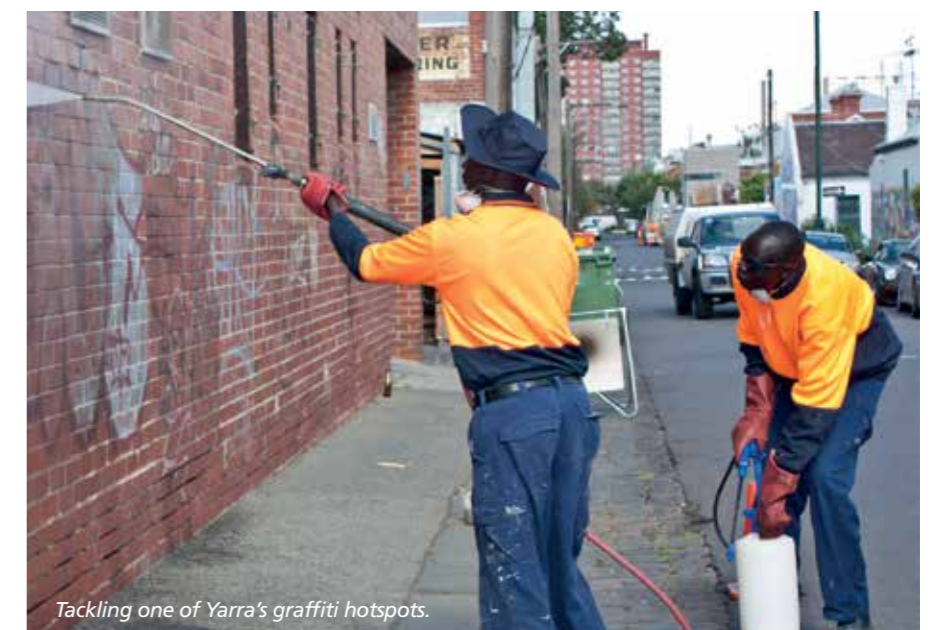
Tackling one of Yarra's graffiti hotspots.

The kits include an environmentally-friendly cleaning solvent, a scrubbing brush, goggles, gloves and a paintbrush. We're also offering discount vouchers for purchasing exterior paint from many local paint and hardware suppliers.