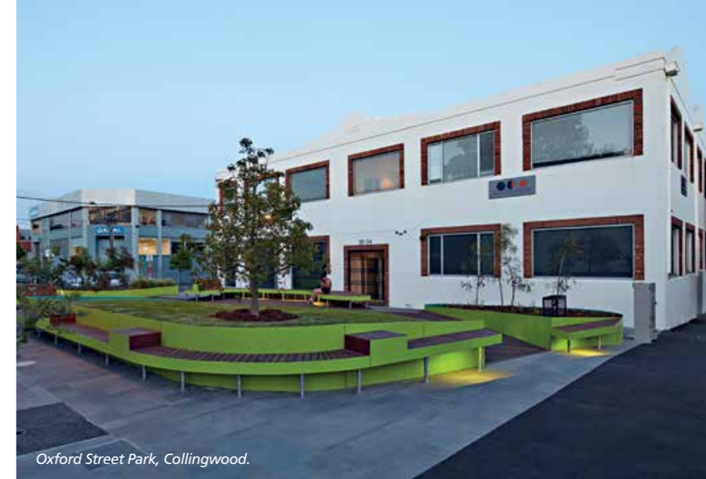
Oxford Street Park, Collingwood.

These developments can offer new community infrastructure – such as meeting rooms and sporting facilities. Over the last few years, Council has used compulsory developer contributions to create five new neighbourhood 'pocket parks'. We also negotiate for social and affordable housing to be included in new