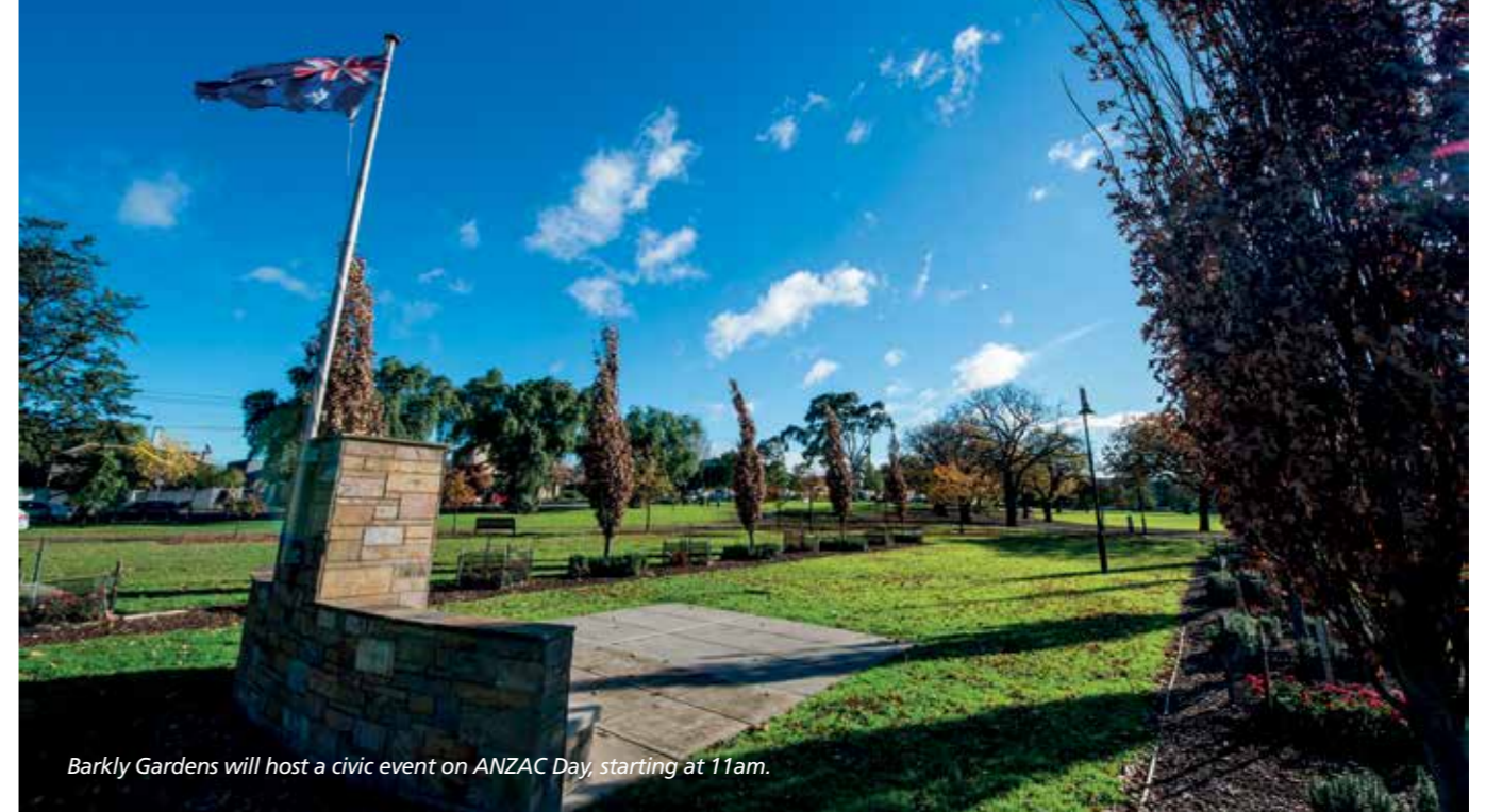
Barkly Gardens will host a civic event on ANZAC Day, starting at 11am.

Council joined with the local community to advocate for mandatory maximum height controls and setbacks for the site, which was subject to a planning application originally proposing to develop the land into a 16 storey building with 476 dwellings, but later changed to a proposal for a building of up to 12 storeys.