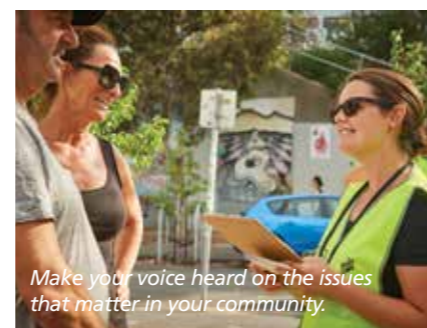
Make your voice heard on the issues that matter in your community.

The proposed Council Plan 2017–21 incorporating the Health Plan also includes a Strategic Resource Plan outlining how the strategies will be financed.