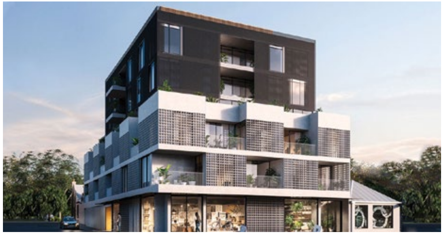
The Rochester apartment building.