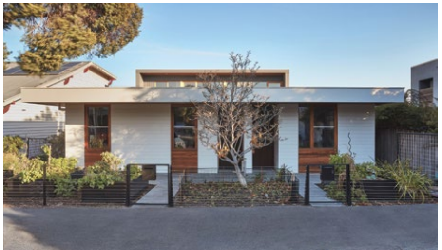
Ford Street townhouses, Clifton Hill.