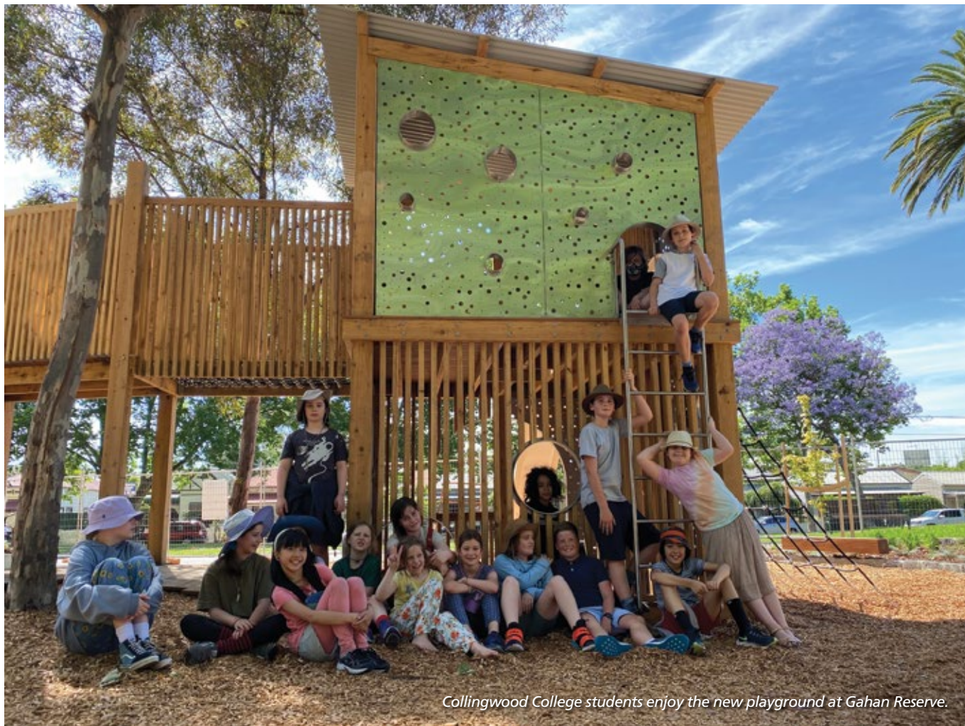
Collingwood College students enjoy the new playground at Gahan Reserve.