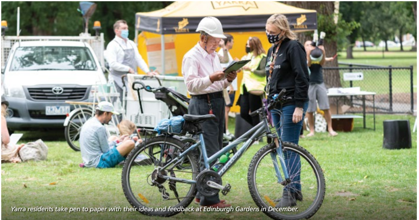
Yarra residents take pen to paper with their ideas and feedback at Edinburgh Gardens in December.

Residents, businesses and visitors have turned out in droves to share their ideas, aspirations and vision for the future during stage one of Yarra's new community vision.