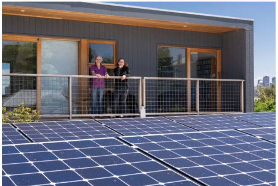
Amaryll and Diana at their very sustainable property in Clifton Hill.

Amaryll and Diana applied the same sustainability ethos to the neighbouring property that they rent out. They are strongly connected to the local community and wanted to create buildings that would last and provide energy freedom for future generations.