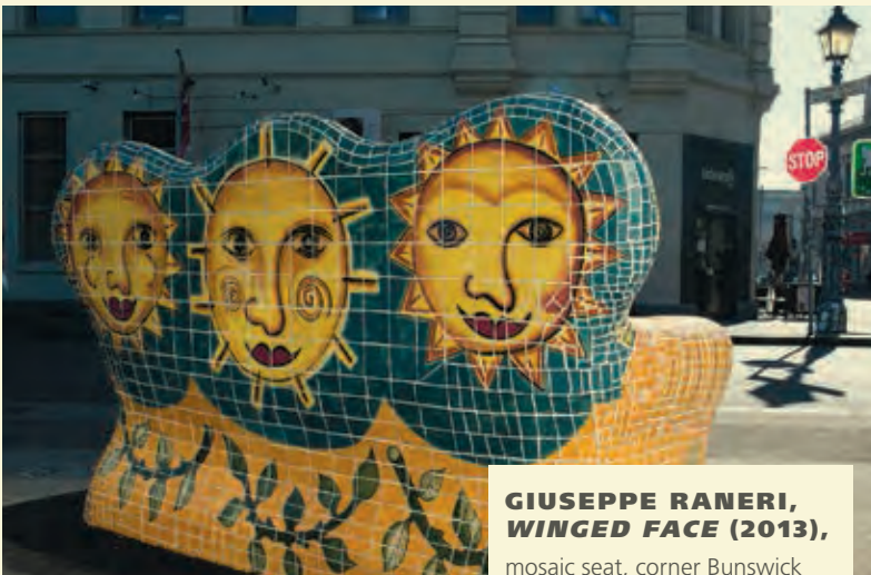
GIUSEPPE RANERI, WINGED FACE (2013),

There is a strong preference for the Percent for Art funds to be aligned directly with the infrastructure development project and for this to be used to commission public artworks integrated within the