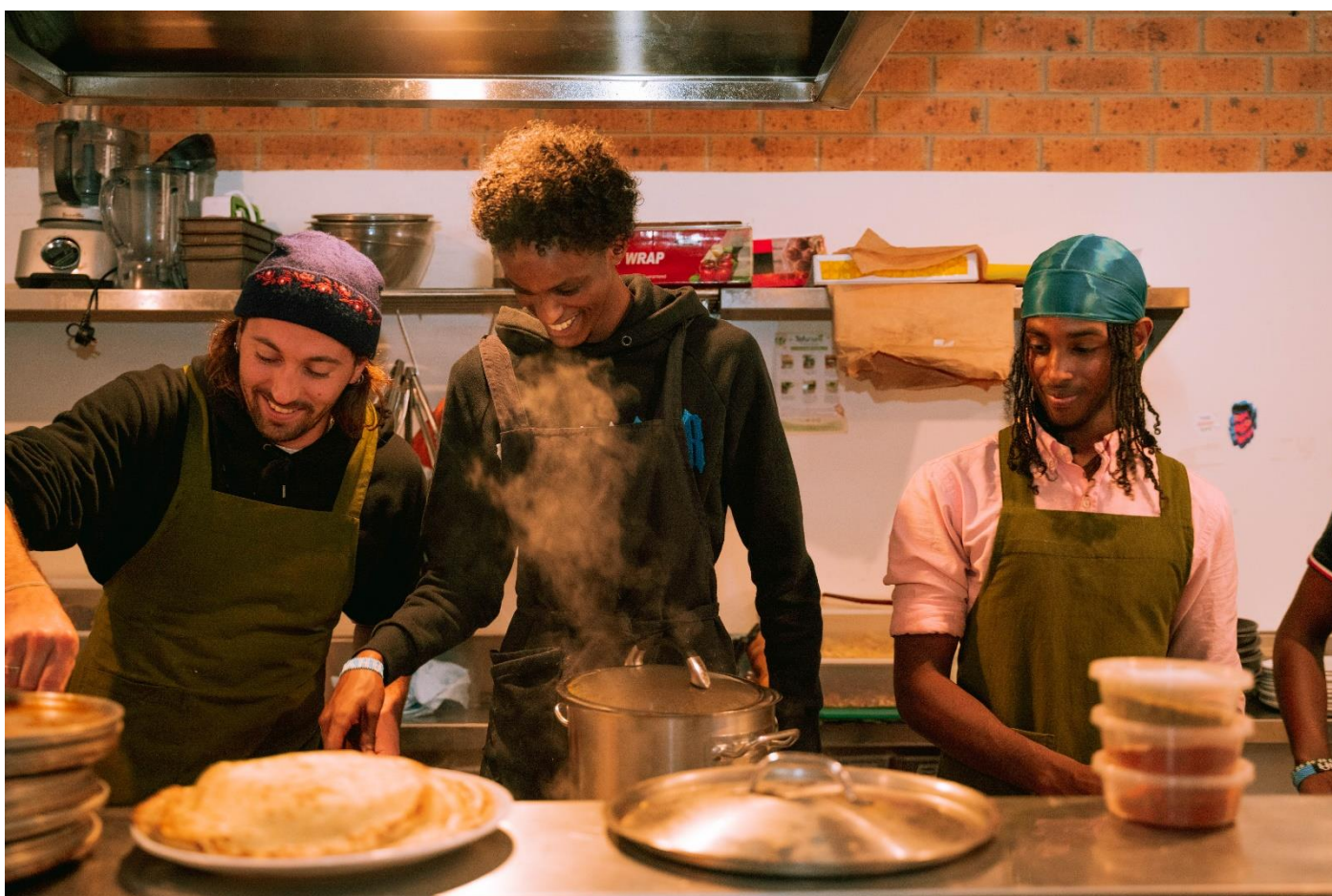
Image : Youth Kitchen, Youth-Led Grant 2022/23